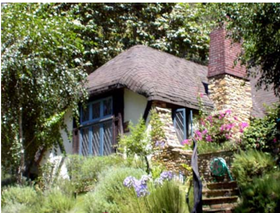
A Hollywoodland house today

The sign was declared a Historic-Cultural Monument in 1973 by the City of Los Angeles. By 1978, the sign was desperately in need of repair. Several individual sponsors came forth to fund the restoration of the sign in 1978. The Department of Parks and Recreation now owns the sign, but it is maintained by the Hollywood Chamber of Commerce.