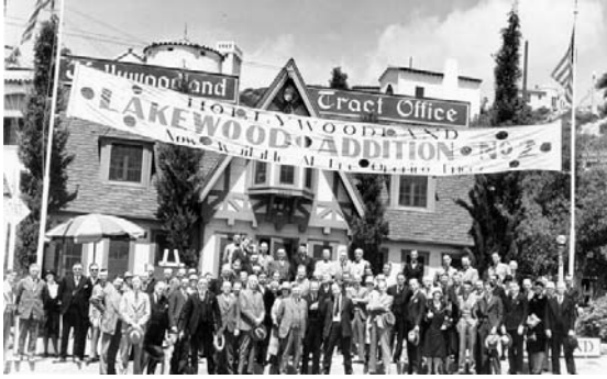
Early days at the Hollywood Realty Office

Hollywoodland is located at the northern end of Beachwood Canyon just below Mt. Lee, neighboring Griffith Park. Twenty years after the city of Hollywood was founded, and thirteen years after Hollywood merged with Los Angeles, the Hollywoodland Realty Building was constructed in 1923, at 2700 North Beachwood Drive. Several years before Hollywoodland was established, Albert Beach had already paved the first road into