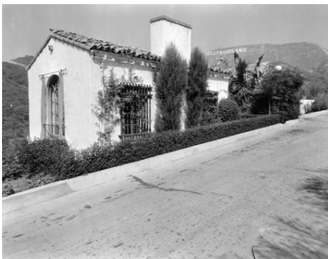
An original house after construction

Hollywoodland has housed numerous celebrity residents such as Doris Day, Lowell Thomas, Bela Lugosi, Melissa Manchester, Bugsy Siegel, Vincent Price, Connie Selleca, and many more. Musicians such as Peter Tork, of the Monkees, and Stan Kenton lived in Hollywoodland. In addition, Busby Berkeley lived on Beachwood in the early years, in a home now owned by Ned Beatty. Humphrey Bogart lived on Ledgewood in a Tudor mansion. Madonna took up residence in an early Hollywoodland mansion for a number of years.