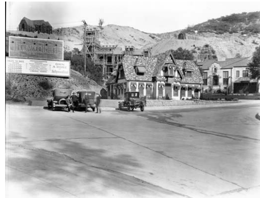
Hollywoodland during construction