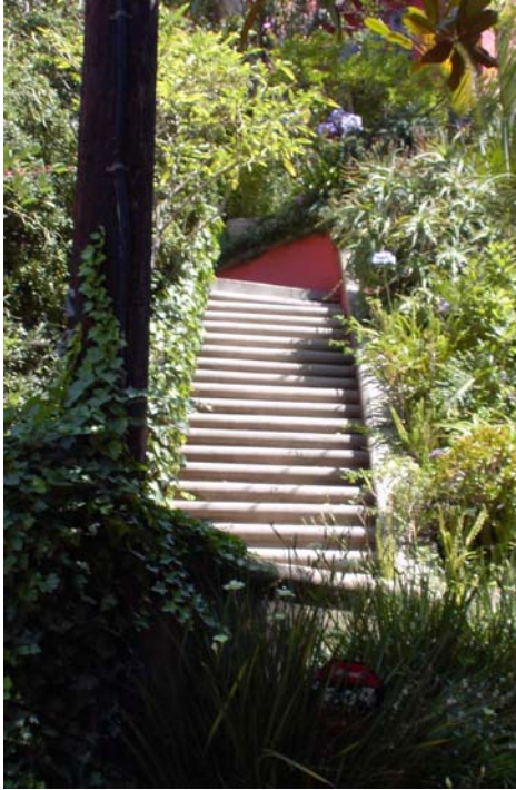
Hillside living means many stairways

began to build to suit their own tastes. When land was cheap in the 1960s, numerous platform homes were built.