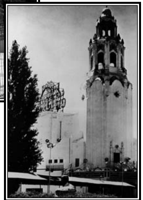
Carthay Circle Theatre, 1926-1969.