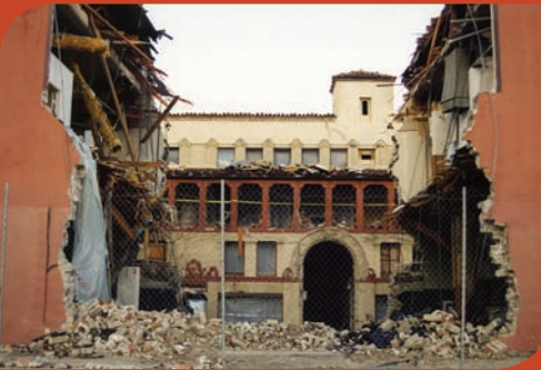
Above: The 1927 McKinley Building on Wilshire Boulevard was demolished in 1998, erasing an important link to the community's past.

Historic buildings and neighborhoods serve as tangible links to our history and our collective memories. Because many cultural centers, residences, and small businesses occupy older buildings, preserving these spaces also maintains important anchors and services for the community.