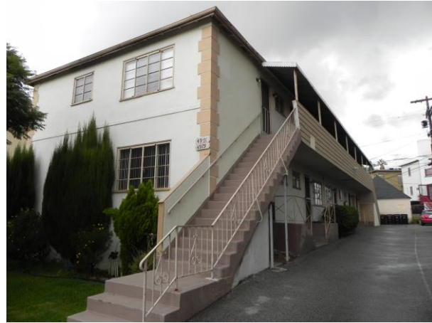
Left: 1435 Bellevue Ave. is a historic fourplex and a contributor to the Angelino Heights HPOZ. Its current zoning is RD2, but would be designated OC-1 in CHIP. Photo courtesy of Historic Places LA. Right: 4973 Franklin Ave. is an early Postwar apartment building, built 1948 in the Minimal Traditional style and identified as a contributor to the Los Feliz Square Multi-Family Residential Historic District by SurveyLA. It is currently zoned R2, but would be OC-2 in CHIP. Photo courtesy of Historic Places LA.

We understand that an offset must occur due to the reduction in capacity, and suggest that Option 3 be considered. Option 3 modestly upzones single-family zones but only in the areas with greatest access to the transit. This refined option introduces new low-rise typologies at a 2- to 3-story scale, which we believe can be compatible with single family zones. The option transitions from larger, denser development closest to transit to a lower scale towards the interior of neighborhoods. We also note that no HPOZs seem to be affected in this option – though many will be affected by the Corridor Transition and Opportunity Corridor programs. We suggest that these two options, adopted in conjunction, will help to relieve pressure on historic resources and existing multifamily housing while locating new missing-middle housing in the most necessary areas.