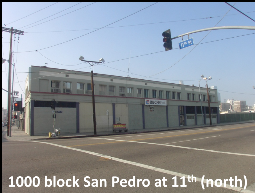
1000 block San Pedro at 11 th (north)