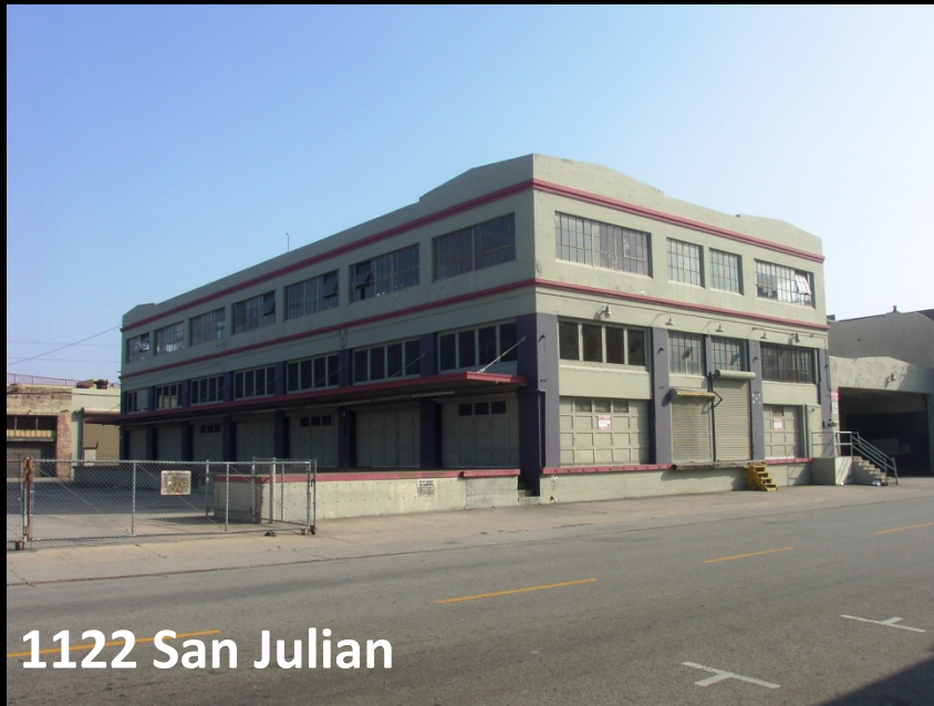
1122 San Julian