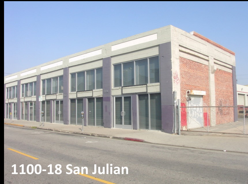
1100-18 San Julian