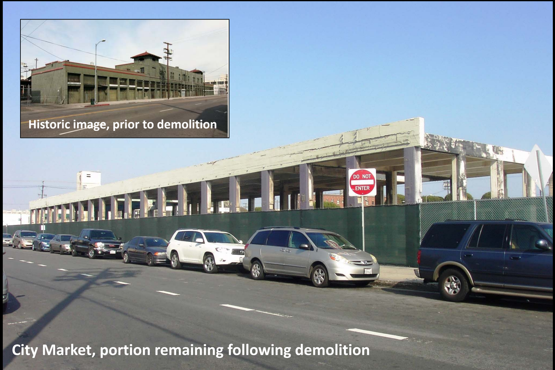
City Market, portion remaining following demolition