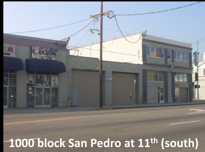
1000 block San Pedro at 11 th (south)