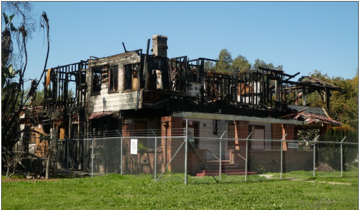
1915 Harriman Residence, following arson fire, as photographed in 2018 by Los Angeles Conservancy