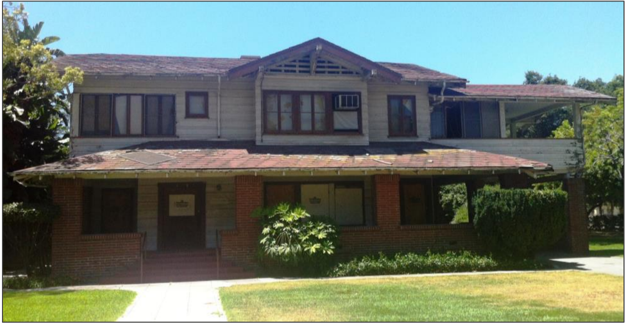
1915 Harriman Residence