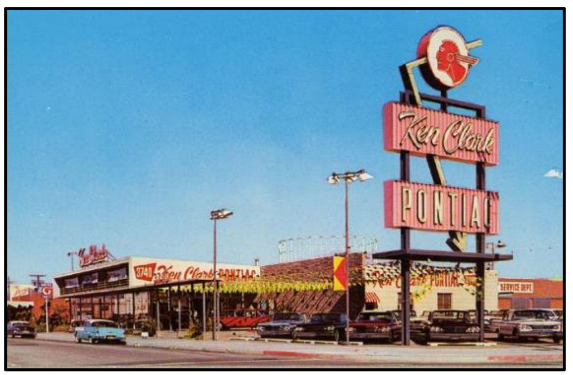
EXAMPLE: Before, Ken Clark Pontiac, Crenshaw Boulevard at Coliseum Street, Los Angeles. 1950s postcard view.