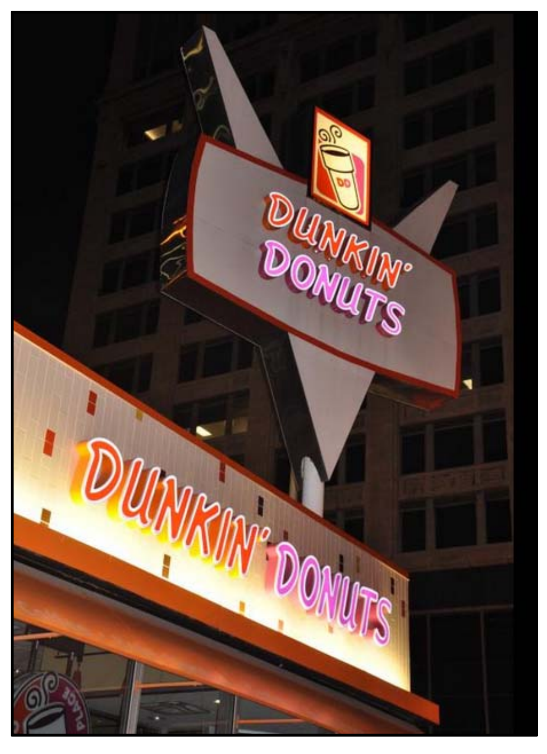
EXAMPLE: Dunkin' Donuts reuse of 1960s building and signage, 48 East Washington Street, Indianapolis, IN.