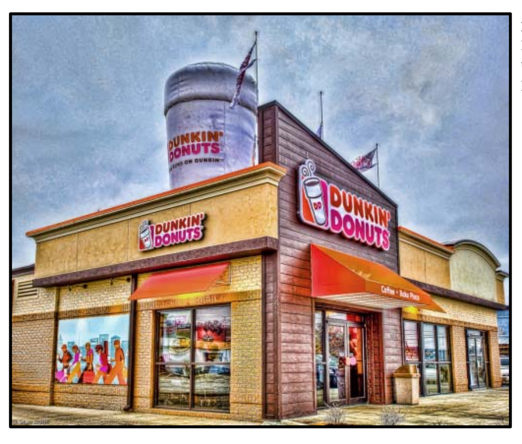
EXAMPLE: Dunkin' Donuts contemporary use of oversized, programmatic signage (giant coffee cup).