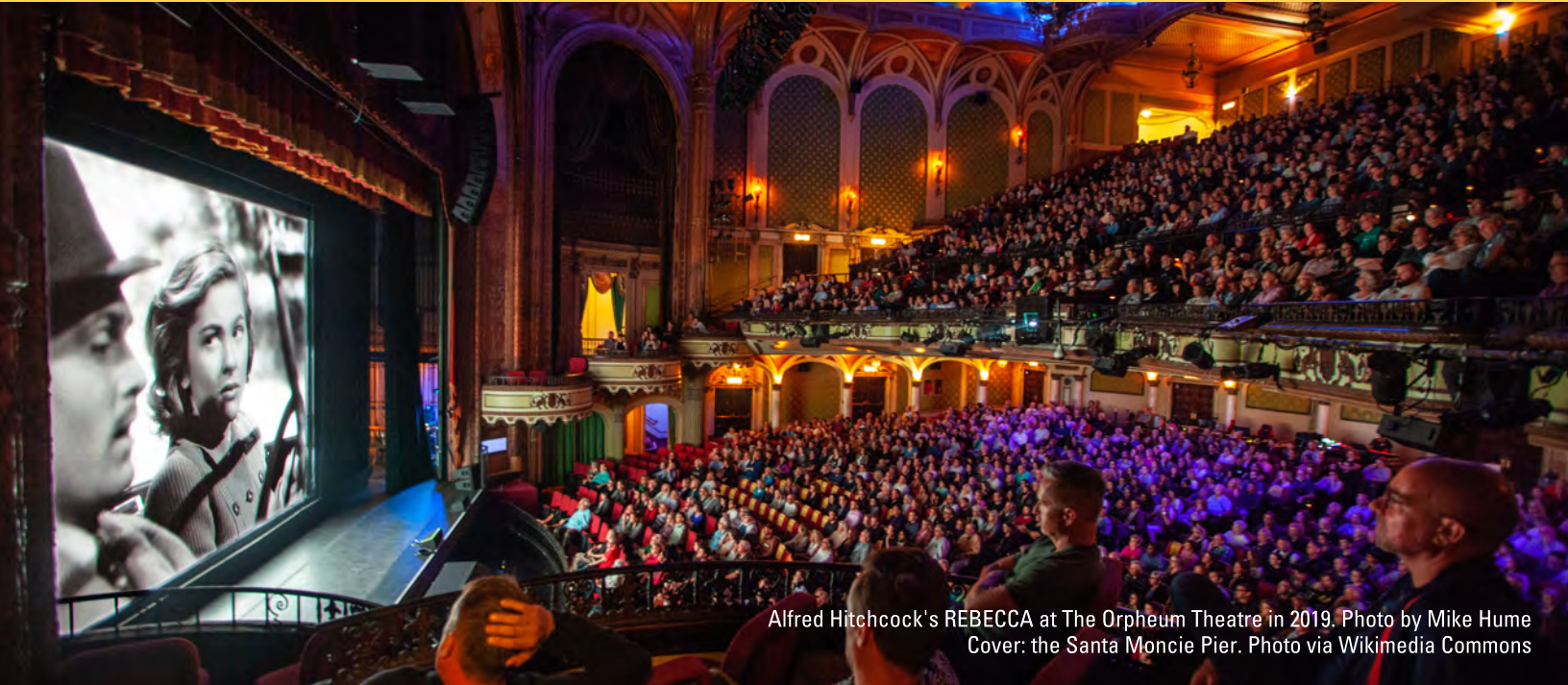
Alfred Hitchcock's REBECCA at The Orpheum Theatre in 2019. Cover: the Santa Monica Pier.