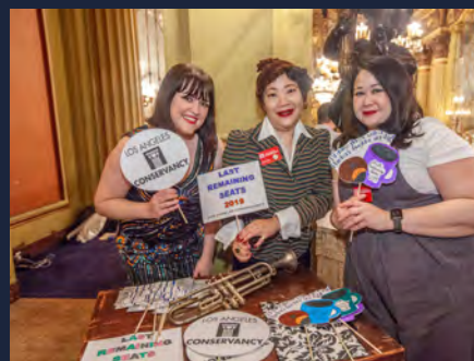
LRS volunteers at the Los Angeles Theatre, 2019.

Be sure to tag the L.A. Conservancy so we can share your tour experience: @LAConservancy