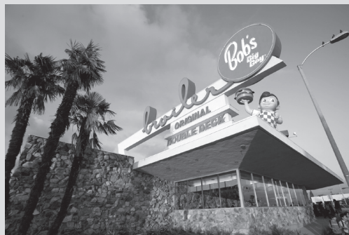
Bob's Big Boy Broiler, recipient of the 2010 President's Award.

We're accepting applications for the 30th Annual Los Angeles Conservancy Preservation Awards, honoring outstanding achievement in the field of historic preservation. Selected by an independent jury, award recipients vary widely, from restoration and rehabilitation projects to advocacy and education efforts. Eligible projects must be located in Los Angeles County and must have been completed by December 31, 2010.