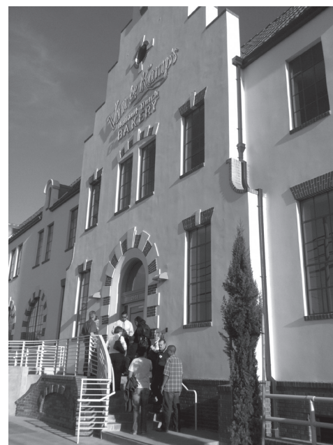
The Van de Kamp's Holland Dutch Bakery building (1930) recently reopened after rehabilitation and LEED certification.

On November 13, the Conservancy partnered with the U.S. Green Building Council