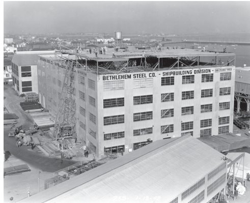
World War II-era building at the Southwest Marine Shipyard, an ongoing advocacy issue (see page 3).

Locally, the approvals needed for development projects are known as entitlements. Securing development entitlements can take years, and the process can be unpredictable. In California, projects that may have an adverse impact on the environment—including historic resources—usually involve environmental review under the California Environmental Quality