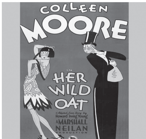
Los Angeles Theatre Organ Society