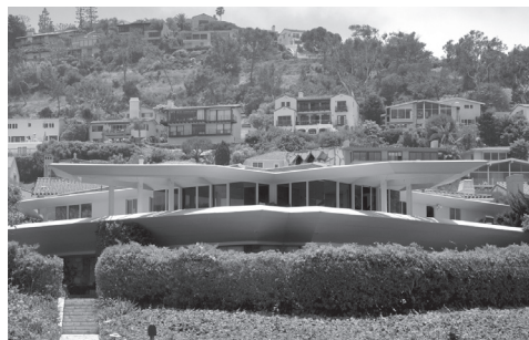
The Lloyd Wright-designed Moore House (1959) is threatened with demolition.

Continued public pressure from members like you has greatly bolstered this effort. For the latest news and opportunities to make your voice heard, subscribe to our Preservation Action Alerts e-mail list at laconservancy.org ("Sign Up for E-News").