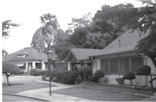
Despite the recession, the Conservancy is busier than ever as developers seek more project approvals. Recent and ongoing issues include (clockwise from top left): North Spring Street Viaduct, the Edward T. Foley Center at Loyola Marymount University, Barlow Hospital in Elysian Park, and the Barry Building in Brentwood.