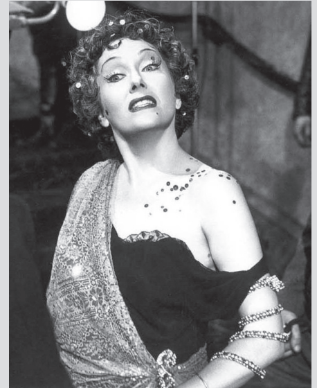
Gloria Swanson as Norma Desmond in Sunset Boulevard (1950).

Thank you to the nearly 500 members who voted in our Fan Favorite poll to select a film for the 25th Annual Last Remaining Seats (LRS)! The votes are in, and this special screening will feature the 1950 classic Sunset Boulevard (subject to print availability).