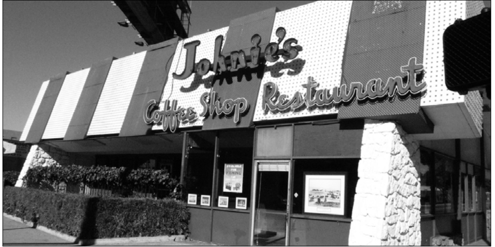
The Conservancy and its Modern Committee recently nominated Johnie's for listing as a Historic-Cultural Monument (HCM).

As many of our members and supporters know, the Conservancy has long been active in the effort to save Wyvernwood, opened in 1939 as L.A.'s first large-scale garden apartment community. Wyvernwood's Miami-based owner intends to wipe out the community and this historic district, which spans nearly seventy acres and is home to 6,000 residents. Wyvernwood's historic buildings