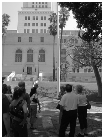
City Hall tour.

Tours are $5 for Conservancy members and children 12 and under; $10 for the general public; reservations are required. Space is limited, so reserve now! Visit laconservancy.org or call (213) 623-2489.