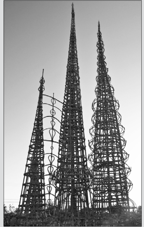
Watts Towers.