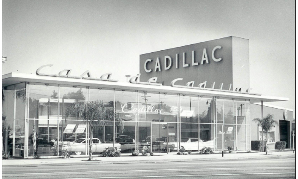
1959 Cadillacs on display in this historic view of Casa de Cadillac.

number of postwar Modern auto showrooms still in near-original condition. Recent losses include Lou Ehlers Cadillac (1955, demolished in 2008) and Crenshaw Ford (1946, demolished in 2009) in Los Angeles, and Crestview Cadillac (1962, altered in 2012) in West Covina.