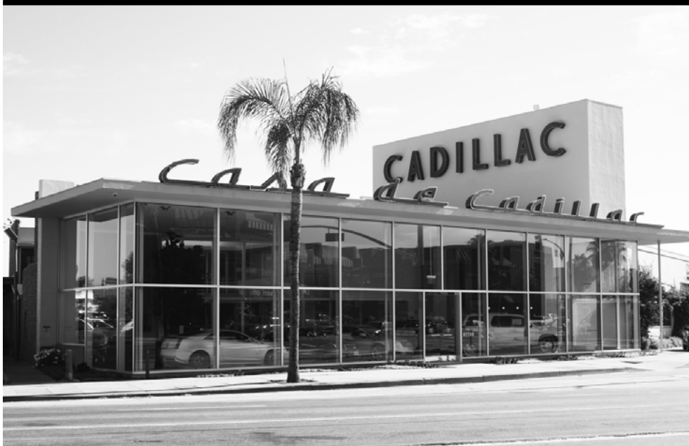
The recently rehabilitated Casa de Cadillac on Ventura Boulevard.