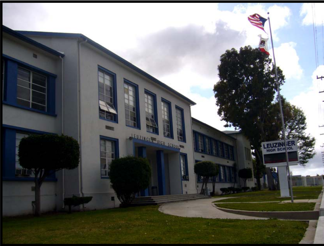
(TOP) Main Administration Building in the 1930s, and in 2011 (BELOW)