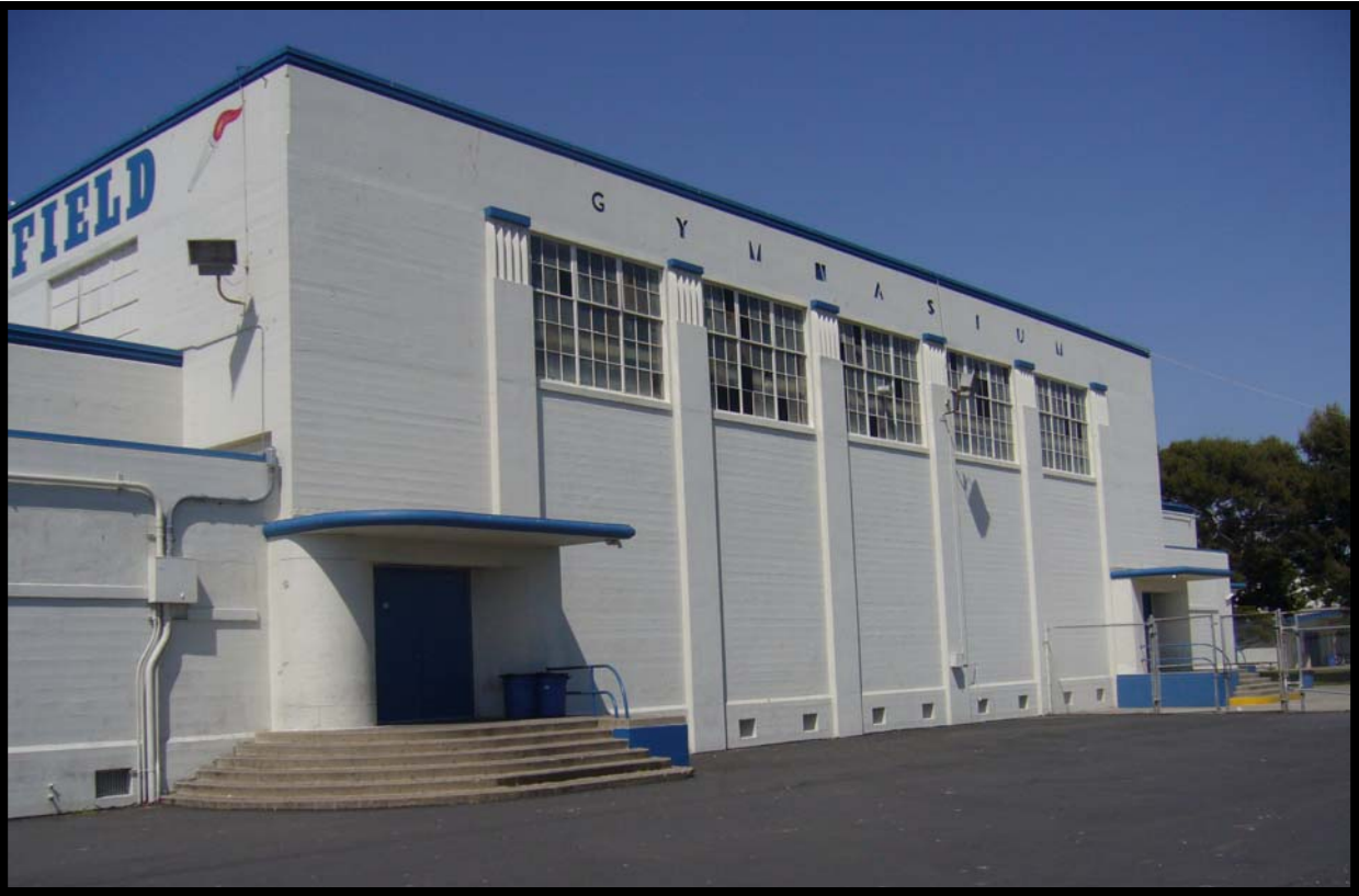
(TOP) 1930s Girls' Gymnasium. (BELOW) 1940s and 50s "finger" buildings on campus, demolished July/August, 2011