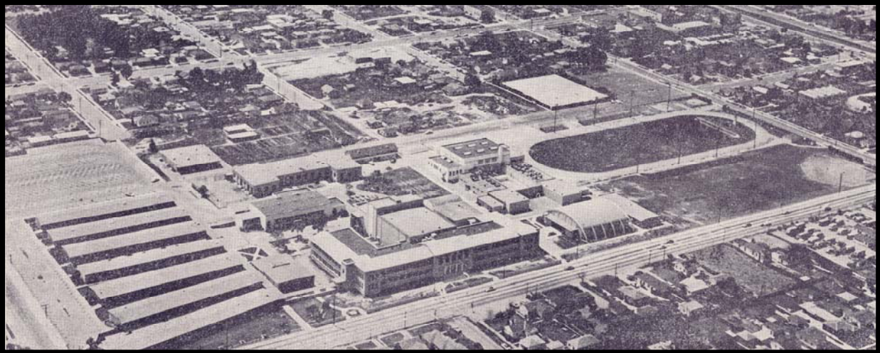
(TOP) Historic aerial view of Leuzinger High School Campus, ca 1966. (BELOW) 1960s campus layout.