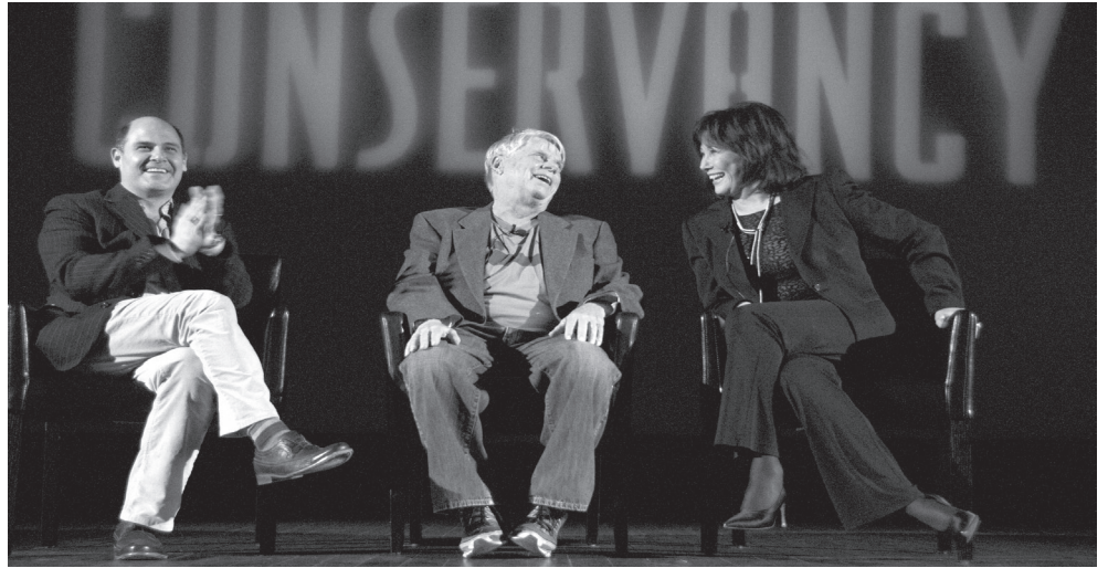
ABOVE: Opening night at the Los Angeles Theatre featured How to Succeed in Business Without Really Trying, presented in conjunction with "The Sixties Turn 50." Co-stars Robert Morse (middle) and Michele Lee (right) were interviewed by Mad Men creator and executive producer Matthew Weiner (left) before the film.