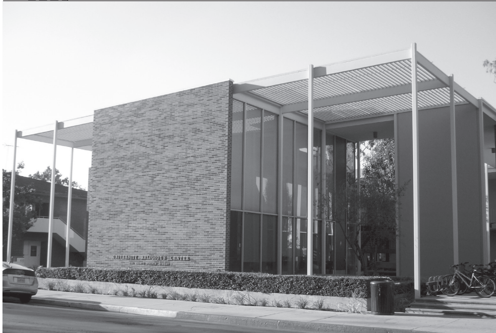
The University Religious Center (Killingsworth, Brady & Associates, 1964) is one of the postwar resources targeted for demolition in USC's proposed master plan.