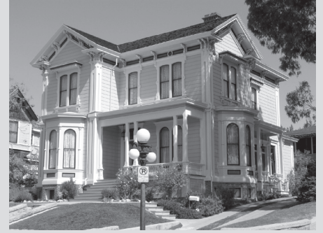
The Foy House (1872) on Carroll Avenue in Angelino Heights.