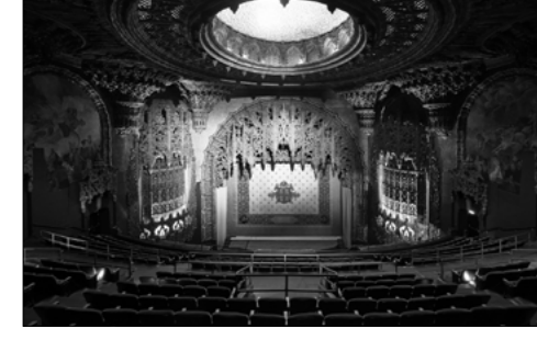
Beautifully rehabilitated The Theatre at Ace Hotel.