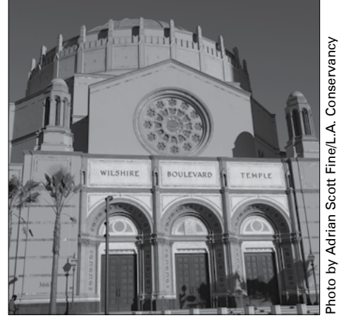
WILSHIRE BOULEVARD TEMPLE TOUR Sunday, April 27

For the latest information about issues and events, visit laconservancy.org.