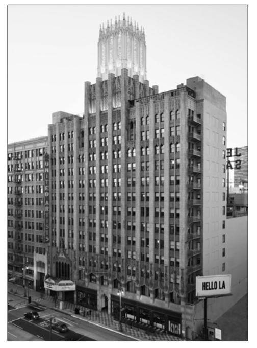
Exterior of Ace Hotel Downtown Los Angeles.

The Conservancy will hold its Last Remaining Seats screening of Back to the Future at The Theatre at Ace Hotel on Saturday, June 21. See page 4 for more information.