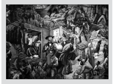
Part of one of the lobby murals in the former Golden State Mutual lobby depicting the history of African Americans in California.

The former home office of the Golden State Mutual Life Insurance Company in West Adams tells a fascinating story of African Americans in Los Angeles, throughout California, and nationally. The Conservancy is thrilled that the murals will remain in the lobby of the building and continue to tell that story.