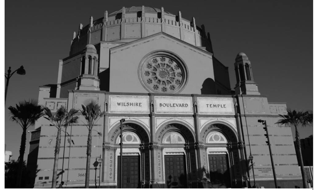
The Conservancy's tour of Wilshire Boulevard Temple will take place on Sunday, April 27.