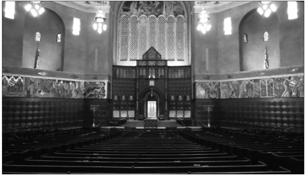
In addition to docent tours of the beautifully restored building and campus, our April 27 event will also include speakers discussing the history, restoration, and future of the Temple, a musical presentation in the main sanctuary, and a closing reception.