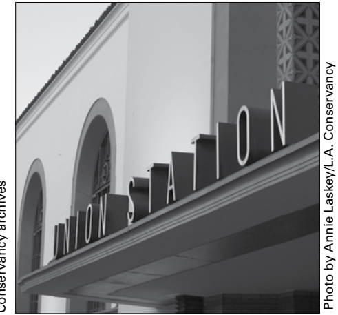
LOS ANGELES HERITAGE DAY El Pueblo Historical Monument Sunday, April 27

Celebrate the history of Los Angeles County at this free festival event, then join us at Wilshire Boulevard Temple for our tour! For details, visit experiencela.com/calendar/ event/58689 .