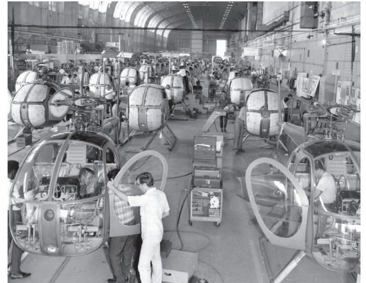
Mass production of OH-6 Cayuse helicopter at Hughes Aircraft in Culver City, circa 1967.

The docent-led tour will include several sites on the campus, including the 750-foot long building where the Hercules was assembled. Tickets are $20 for Conservancy members ($25 for the general public; $10 for kids twelve and under) and are available at laconservancy.org .