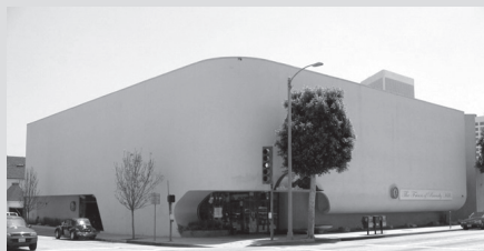
The Friars Club building circa 2006.

The loss of the Friars Club building underscores the need for greater recognition of our 1960s architectural heritage, as well as the need for stronger preservation laws at the local level. In preparing our 2008 Countywide Preservation Report Card (available at laconservancy.org ), the Conservancy found that a third of local jurisdictions in Los Angeles County have no preservation protections for historic resources. We will continue to advocate for such protections, and we stand ready to assist Beverly Hills and other cities in this effort.