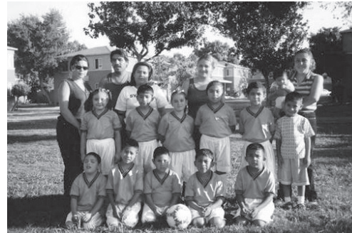
2001 Wyvernwood soccer tournament, known as Mundialito de la Esperanza.

Residents are working with the Conservancy, the National Trust for Historic Preservation, resident groups, and community organizations. They've held rallies, attended hearings, and used tools such as oral histories to raise awareness of how much Wyvernwood means to them.