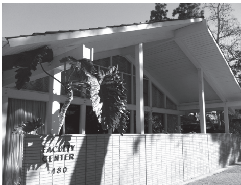
The 1959 UCLA Faculty Center, now threatened with demolition.