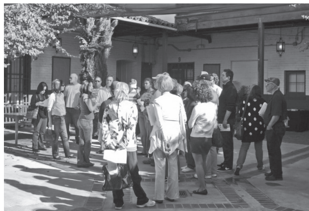
Guests learn about the 1932 International Institute of Los Angeles in Boyle Heights.