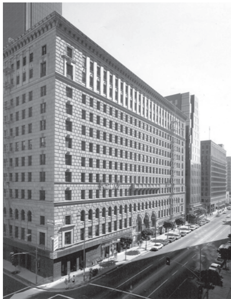
Roosevelt Building.