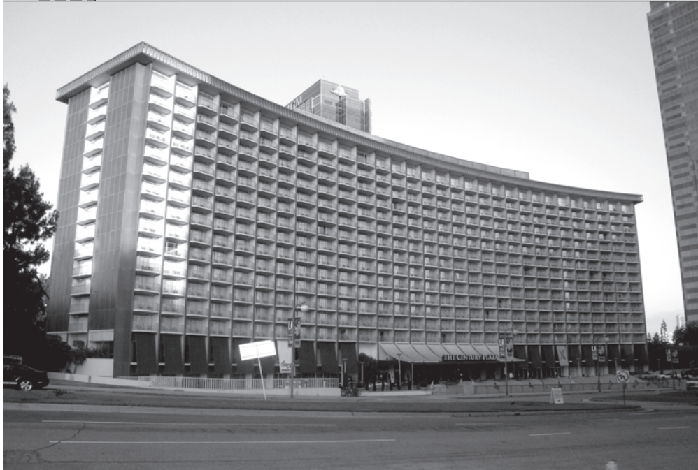
The 1966 Century Plaza Hotel, proposed for demolition and replacement with two 600-foot towers. The hotel received a $36 million facelift a year ago.