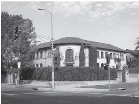
Petitfils-Boos Residence.