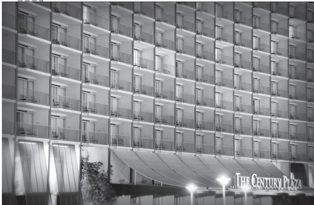
The 1966 Century Plaza Hotel in Century City, threatened with demolition since late 2008, will now be the centerpiece of Next Century Associates' mixed-use development.