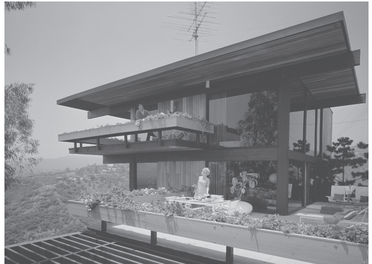
The 1966 Franks House is one of the homes featured on the April 18 tour.

Last but not least, join us for the "Home Sixties Home" tour on Sunday, April 18 , when we'll visit some great '60s homes in Brentwood. One of the tour sites, last opened to the public for a 1968 home tour, is a redwood treehouse bachelor pad complete with walk-in wine cellar, steam room, and Jacuzzi tub. Perched on the hillside overlooking a canyon