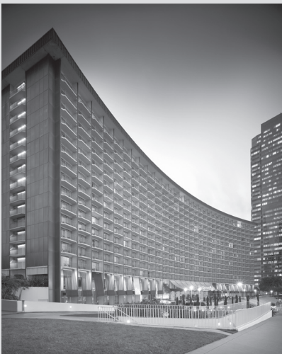
The Minoru Yamasaki-designed Century Plaza Hotel, 2010.

Our success with the Century Plaza Hotel would not have been possible without the support of you, our members. Each and every Conservancy member makes a crucial difference in our ability to influence decision makers on important issues like this. Thank you. We'd also like to thank the hundreds of people who wrote letters of support and the nearly 1,500 people who pledged their support for the hotel's preservation. We still have much to do, and we will keep you posted.