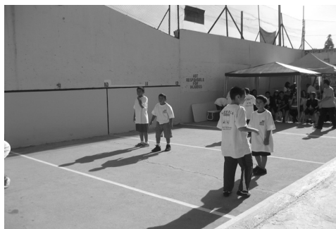
Kids at the Maravilla Handball Court.

The effort to preserve the Maravilla Handball Court is part of the National Trust for Historic Preservation's "This Place Matters" campaign, spearheaded locally by the Conservancy, which identifies important community-based historic sites that merit national attention.