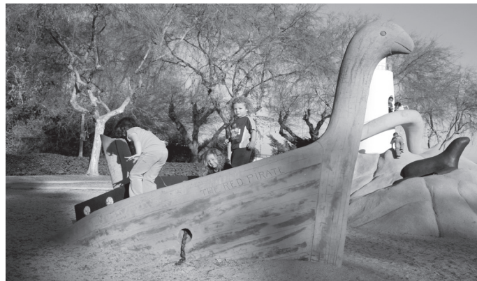
Kids enjoy the whimsical playground of La Laguna de San Gabriel, site of the May 1 sixties picnic.