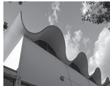
The 1964 Hawthorne Memorial Center.

For details, visit laconservancy.org/sixties . We look forward to seeing the city through your lens!