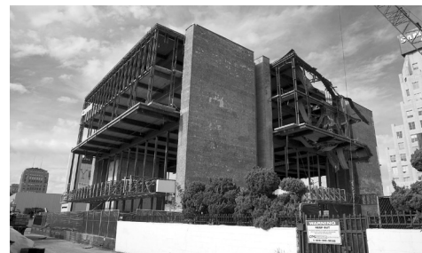
Columbia Savings Building under demolition.

In February, the Ennis House Foundation reduced the price of the Ennis House from $15 million to $10,495,000. While the price reduction reflects the current state of the housing market, it also opens the door for new potential buyers to purchase and restore the 1924 Frank Lloyd Wright masterpiece. The lower asking price will allow a buyer to invest more funds directly into the home's restoration rather than the purchase itself.