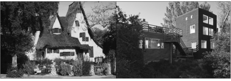
(left) The Witch's House (1920), a designated local landmark in Beverly Hills. (right) Calabasas has designated buildings from the recent past, including the 1984 Benson House designed by Frank Gehry.

Congratulations to the following cities, which have made significant strides in their preservation programs since the release of our last Preservation Report Card in 2008.