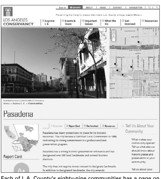
Each of L.A. County's eighty-nine communities has a page on our website.

Each community's name in the Digital Report Card chart links to a dedicated web page for that community. The community page contains the jurisdiction's Report Card scores, links and downloadable documents related to the community's preservation program, links to the community's official website and local advocacy groups if relevant, and information on how residents can get involved in preserving their local heritage. Instant access to information about nearby communities offers context about preservation in a specific area of the county.