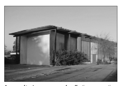
A range of tools are necessary for effective preservation. For example, West Covina has a preservation ordinance, but the 1959 St. Martha's Episcopal Church was approved for demolition during the environmental review process, despite evidence of the building's architectural significance.

A new section offers practical tips for improvement, encouraging communities to contact the Conservancy for assistance. An innovative new Digital Report Card at laconservancy.org/report-card is transforming our public outreach and the use of Report