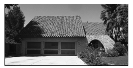
Some communities or neighborhoods may not think they have any significant buildings, because they developed primarily after World War II. Yet more resources from the recent past are gaining recognition, such as the remaining Los Encinos Homes in Woodland Hills. These 1976 homes were identified as a potential Historic Preservation Overlay Zone (historic district) in the City of Los Angeles' SurveyLA.

Fifty-one communities (57%) received "F" grades this year (they have no protections at all), indicating a clear need for more outreach and assistance to local governments throughout L.A. County. The Conservancy is eager to help communities in their efforts and will be reaching out with more resources, tools, and technical assistance.