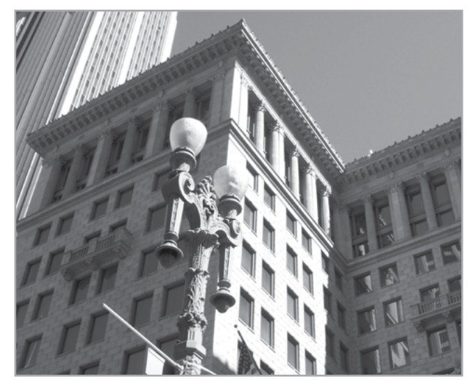
PacMutual recently became the oldest building in Southern California to earn LEED Platinum certification.

This event is free and open to the public. RSVP via your returned ballot or at info@laconservancy.org by 12 p.m. on Wednesday, May 28, 2014.