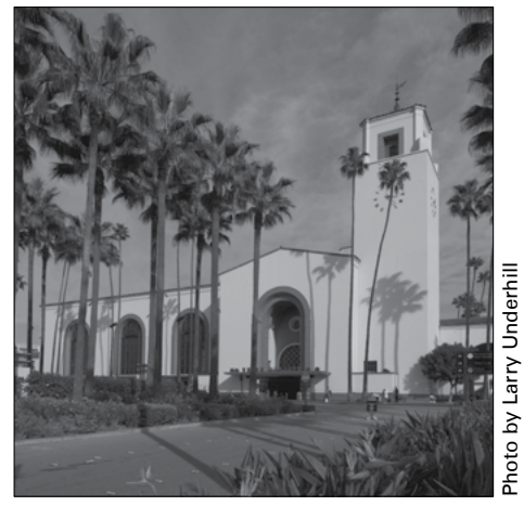
ANNUAL BENEFIT Union Station Saturday, May 17

For the latest information about issues and events, visit laconservancy.org.