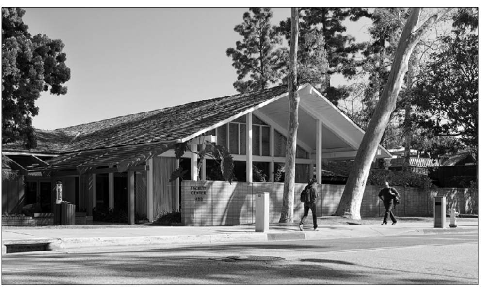
The State Office of Historic Preservation will soon review the nomination of the 1959 UCLA Faculty Center to the California Register of Historical Resources.

In August 2010, UCLA proposed demolishing the Faculty Center to make way for a hotel and conference center, prompting outcry from nearby residents, university faculty, and the preservation community. The university later chose to relocate the conference center project to a new site. Both then and now, UCLA representatives oppose recognizing the Faculty Center as a historic resource.