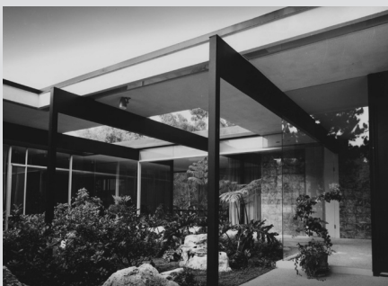
Historic view of entry by Julius Shulman. © J. Paul Getty Trust. Used with permission. Julius Shulman Photography Archive, Research Library at the Getty Research Institute (2004.R.10).

The sale price was reported as $12.8 million, though the name of the buyer had not been disclosed as of press time. As details unfold, we will post updates on our website at laconservancy.org .