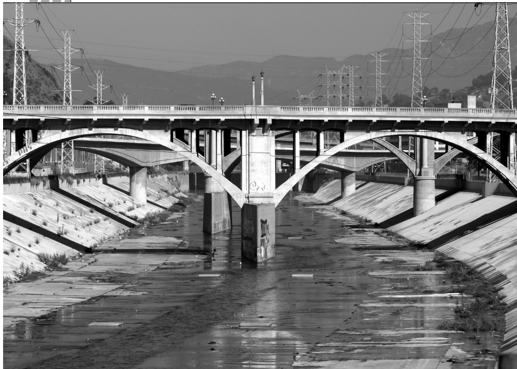
The 1929 North Spring Street Viaduct (Los Angeles Historic-Cultural Monument #900).