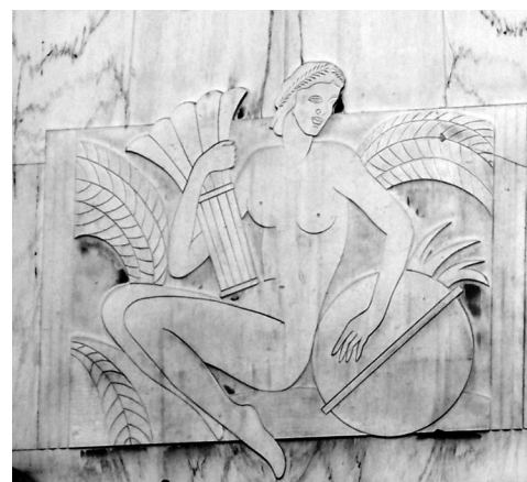
LEFT: 533 South Broadway with portions of the marble façade removed. RIGHT: This intaglio (engraved design) of a classical maiden was removed from the center of the façade.

A fixture of Riverside Drive in Burbank for sixty-two years, Papoo's Hot Dog Show closed in August after being purchased by a