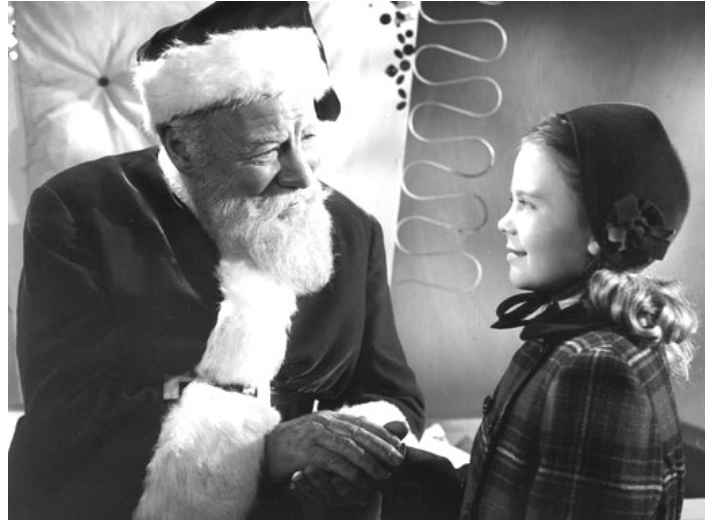
Edmund Gwenn as Kris Kringle and Natalie Wood as Susan Walker in the 1947 classic Miracle on 34th Street.

Tickets for this special event are $15 for the general public, $10 for Conservancy members, and $5 for children 12 and under. For details, tickets, and a special discount offer, visit laconservancy.org . Special thanks to the event sponsor, Bank of America. Happy holidays!