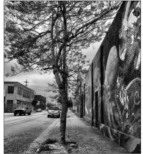
Second Street looking east toward the Challenge Cream and Butter Association Building.

Along with the influx of artist residents, art galleries, bars, and performance venues began to open, creating a neighborhood identity and serving as incubators for ground-