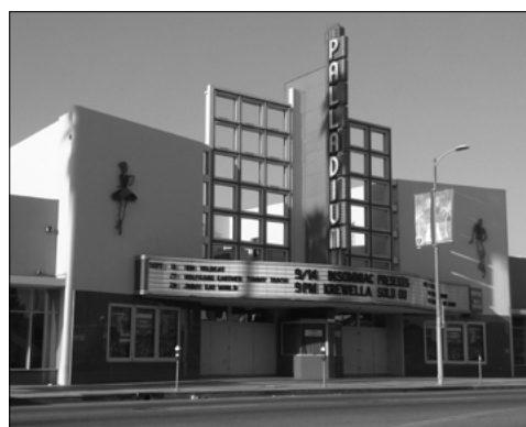
Hollywood Palladium.

In the Conservancy's comments on the Notice of Preparation for the project's Draft Environmental Impact Report, we urged the developer to commit fully to the Palladium's interior rehabilitation and include it as a key part of the proposed project. We also urged that the new construction be designed in a way that does not overwhelm the historic building or its signature nighttime presence along Sunset Boulevard.