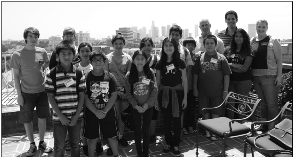
BELOW: Students from HOLA with Conservancy staff and volunteers on the private rooftop terrace at Southwestern Law School (formerly Bullock's Wilshire).