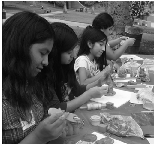
LEFT: HOLA students designed and built their own buildings out of clay.

Each day's outings were preceded by slide show presentations and followed by engaging, behind-the-scenes tours and a variety of hands-on activities. All of these activities were designed to introduce HOLA students to the rich architectural history within their neighborhood and city, and to the importance of sustaining their community's built environment.