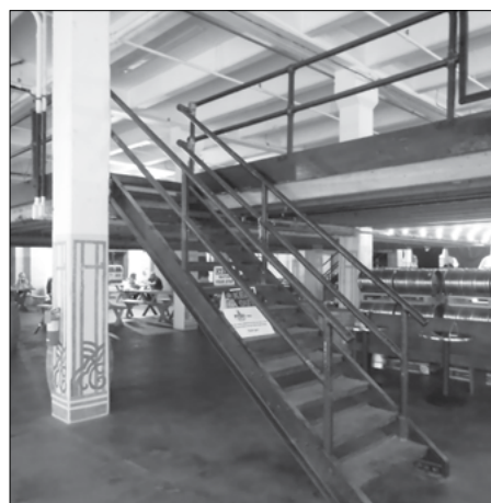
Angel City Brewery.

For the latest information about issues and events, visit laconservancy.org .