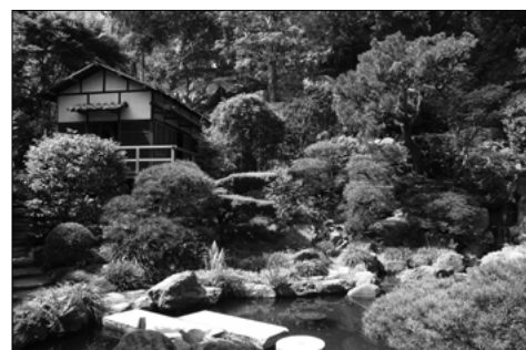
UCLA Hannah Carter Japanese Garden.

The Conservancy and our Modern Committee submitted a Los Angeles Historic-Cultural Monument (HCM) nomination for Johnie's in spring 2013. In August, the City's Cultural Heritage Commission voted to recommend HCM designation for Johnie's. In early November, the nomination is set to go before the City's Planning and Land Use Management (PLUM) Committee for a recommendation vote, followed by a final vote by the full City Council.