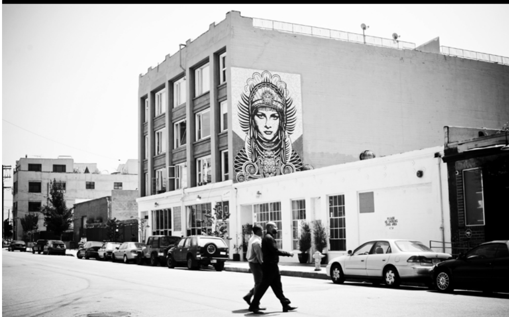
Our tour of the Arts District in downtown Los Angeles will take place on Sunday, November 10.