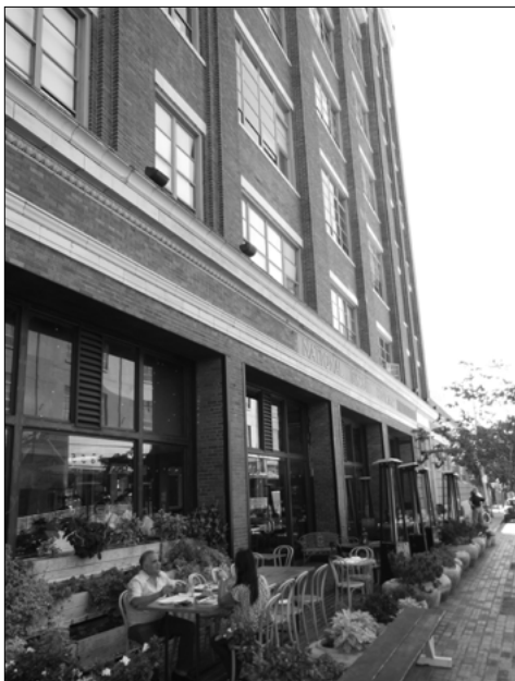
Biscuit Company Lofts.

With the many changes taking place in the Arts District, now is the perfect time to explore this neighborhood's rich history. We look forward to spending a day in this unique neighborhood, reading the many layers of history in its built environment.