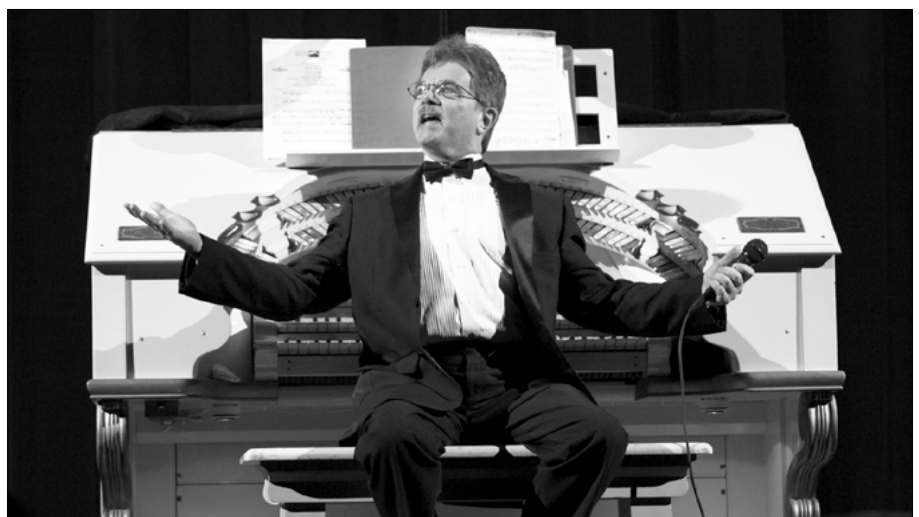
To see more photos from our 2013 series, visit our Facebook page at facebook.com/losangelesconservancy .