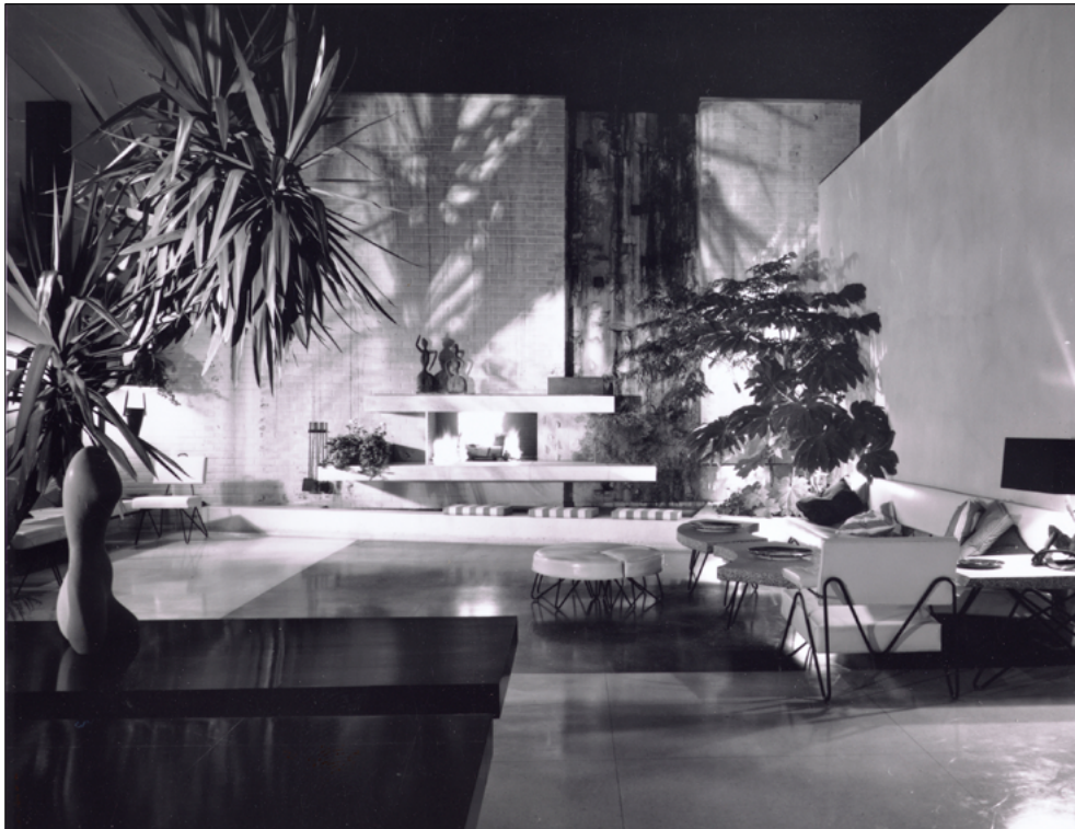
The Brody House atrium.

Don't miss this special opportunity to spend an evening at the Brody House! For further details and to purchase tickets to this extraordinary event, visit laconservancy.org/benefit .