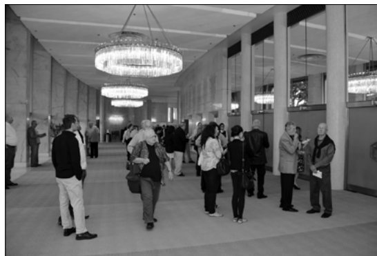
LEFT: Audience members wait for the doors to open at The Music Center’s Dorothy Chandler Pavilion.