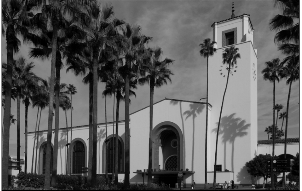
L.A.'s iconic Union Station.

Since 1984, the Conservancy's Modern Committee (ModCom) has been a trailblazer