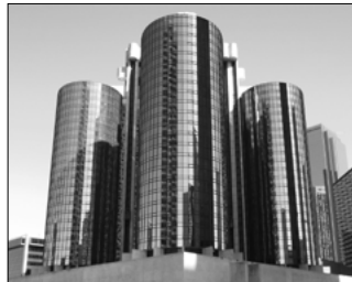
Westin Bonaventure Hotel.