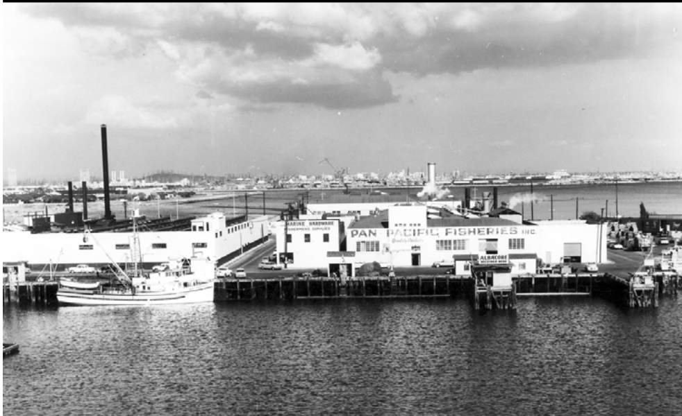
The amended Port Master Plan now allows a mixed-use land use for Fish Harbor, providing flexibility in reusing historic buildings like the 1946 Pan-Pacific Fisheries Cannery (shown at center). Once the most modern facility on Terminal Island, it is currently empty and awaiting a new use.