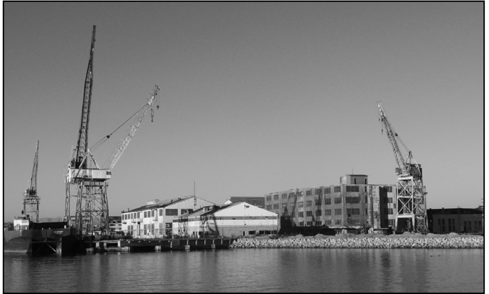
Southwest Marine, an identified historic district dating back to 1918, is the last remaining example of the once highly significant shipbuilding industry at the Port of Los Angeles.

Terminal Island is much different than the place it was forty or fifty years ago. Acres of cargo containers, towering cranes, and vast areas of landfill have transformed it into what many might describe as a desolate landscape. Yet if you do a little sleuthing and exploring, the story of Terminal Island begins to reveal itself—largely by the historic buildings still standing there, especially along Fish Harbor.