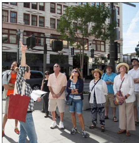
Downtown Renaissance.