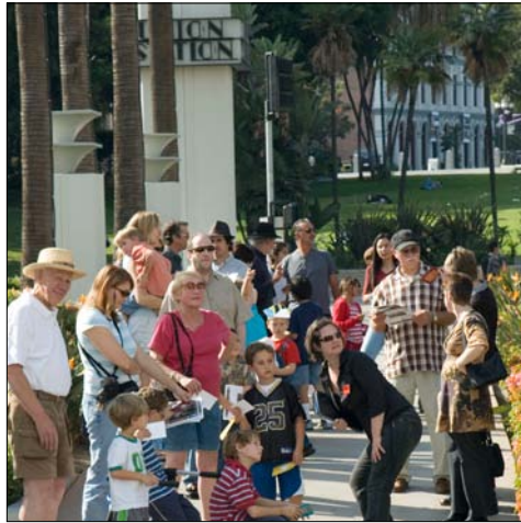
Explore Union Station in July on this special family-friendly tour!

For reservations, visit laconservancy.org/tours or call (213) 623-2489.