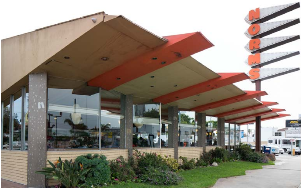
Even icons of Google architecture like Norms La Cienega still face demolition threats.