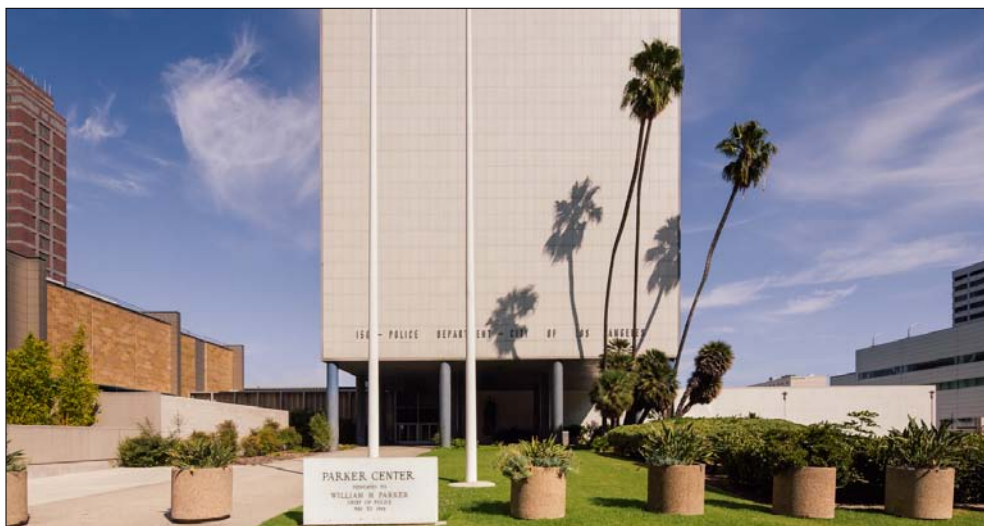
Downtown L.A.'s Parker Center, threatened with demolition despite its critical role in the history of policing and Los Angeles.

Faring Capital, the owner of the historic building locally known as The Factory, has proposed redeveloping the site between Robertson Boulevard and La Peer Drive in West Hollywood. The proposed mixed-use project would include a 251-room hotel, plus restaurant and retail space. The proposal currently calls for the demolition of The Factory