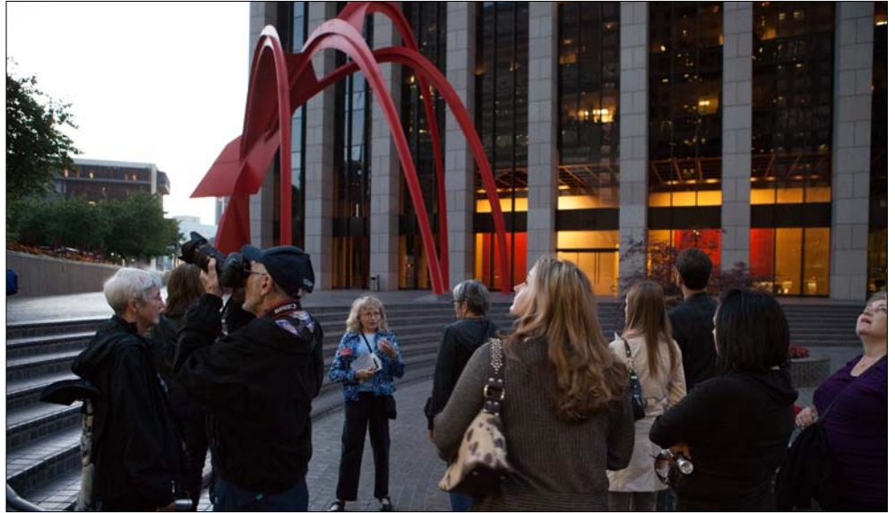
The Conservancy is offering extended dates of our popular Modern by Moonlight tour this summer.

Summer is here, and with it, the Conservancy's evening walking tours. This popular series features shorter versions of two regular walking tours (Art Deco and Downtown Renaissance), plus our crowd-pleasing nighttime twist on our Modern Skyline tour called Modern by Moonlight.