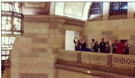
Tourgoers visiting the rotunda at City Hall. Our summer evening tours on August 17, 24, and 31 are the only times we will tour City Hall this year.

The Art Deco and Past Meets Present tours are slightly shorter versions of regularly scheduled tours offered on Saturday mornings. Art Deco focuses on the exuberant architectural style prevalent in the late 1920s. Past Meets Present (formerly Downtown Renaissance) explores the old financial district on Spring Street, now home to lofts, galleries, and cafes.