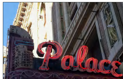
Eye-catching signs such as the Palace Theatre's marquee contribute to Broadway's historic character.

New sign ordinances often generate controversy and opposition. Yet the Historic Broadway Sign District is unique, as businesses and building owners alike were part of the process from the start and ultimately supported the effort. One aspect that sets this ordinance apart is a financial incentive provi-