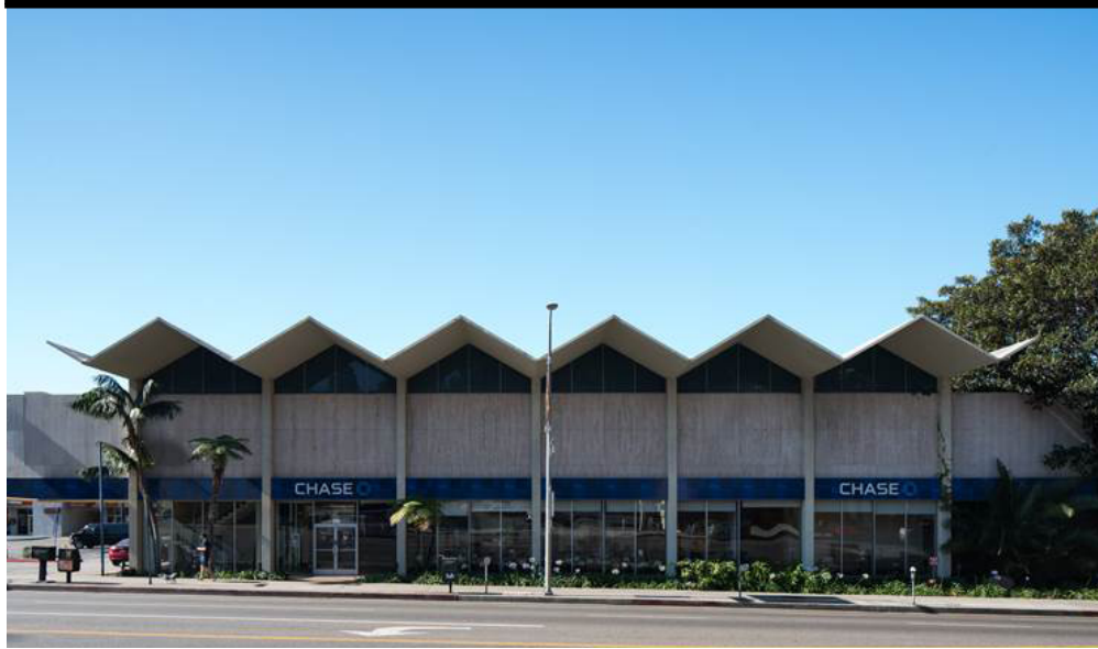
The 1960 former Lytton Savings Building (now Chase Bank) at Sunset and Crescent Heights Boulevards is threatened with demolition. The Conservancy believes that the new development proposed for the site can and should incorporate this building.