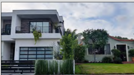
Older and historic neighborhoods throughout Los Angeles and the region are at risk from the rampant teardown and mansionization trend.

The ordinance revisions are slated to go to the City Planning Commission in July. We will keep you posted on this and other efforts to protect the character of our communities.