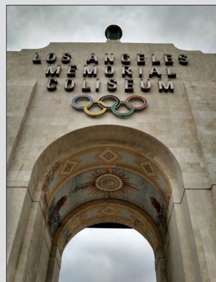
The Los Angeles Memorial Coliseum will retain its National Historic Landmark status after its renovation project is complete.

We thank USC for working so closely with us on this issue.