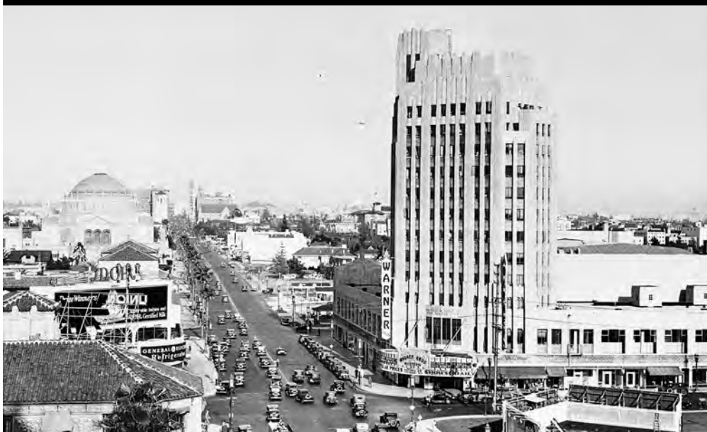
This 1934 image of what is now Koreatown shows many landmarks that are still standing today, including the Wilshire Theatre, Wilshire Boulevard Temple, and in the distance, the Bullock's Wilshire building.