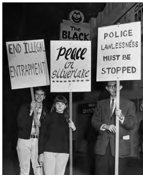
For decades, the Los Angeles region and its residents have played a vital role in bringing the experiences of LGBTQ communities into the public consciousness. In 1967, The Black Cat Bar in Silver Lake was home to one of the earliest known demonstrations in support of LGBTQ civil rights.

For more than thirty years, the Conservancy has been involved with issues surrounding the 710 Freeway extension, and its impacts on historic resources in San Gabriel Valley communities and El Sereno. Many cities and organizations worked diligently over the years to stop the 710. We are especially grateful to Pasadena Heritage, the No710 Action Committee, and the National Trust for Historic Preservation for their leadership.