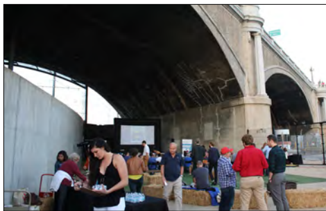
Over a thousand people have watched our first three short films online or at one of our recent screenings.

Earlier this year, we released the first three installments in our short film series, LGBTQ Historic Places in L.A. They featured on-site interviews with community members