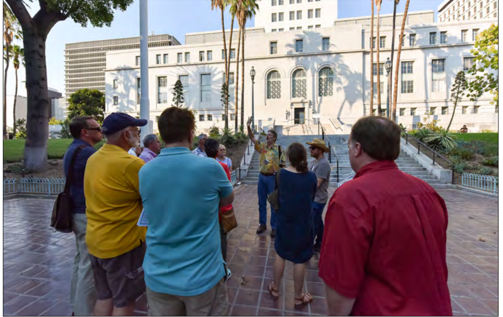
Last summer's City Hall tours sold out very quickly. Be sure to reserve your spot on the summer walking tour of your choice while you can!