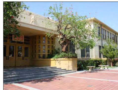
We will hold the October 13 L.A. Historic Neighborhoods Conference at Lincoln High School in Lincoln Heights.