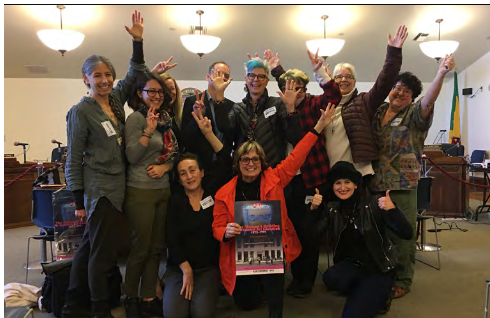
The Woman's Building is now a designated landmark! Community members and artists involved with the Feminist Studio Workshop supported the landmark nomination throughout the process by attending hearings, testifying, writing letters of support, and helping spread the word.

In May, the City of Los Angeles' Cultural Heritage Commission voted in support of our