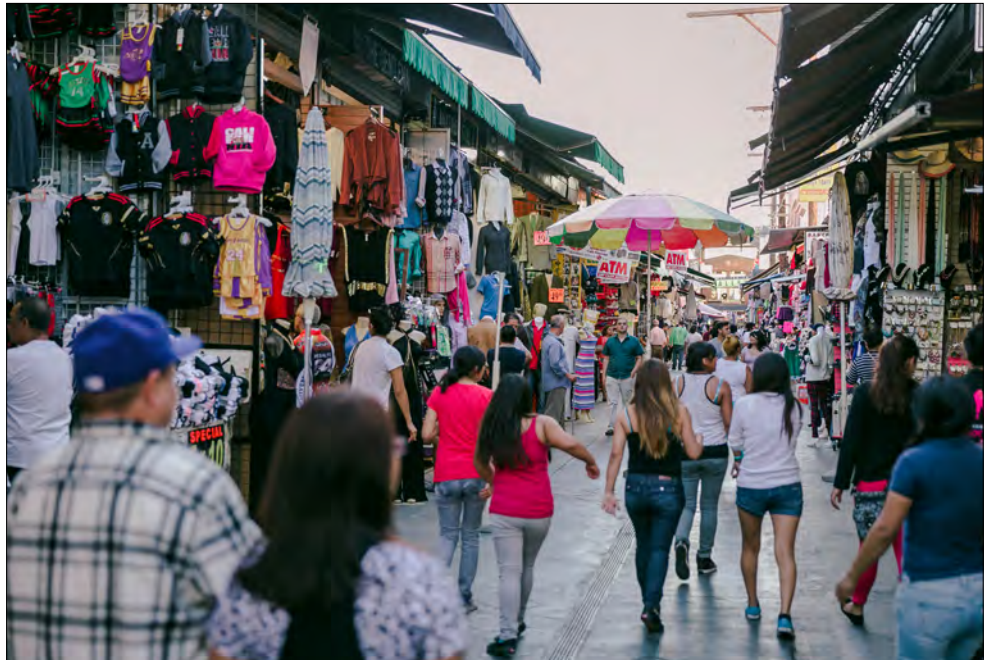
Our special event on October 20 explores downtown L.A.'s Fashion District! Choose from multiple 60/90-minute docent-led tours throughout the day.