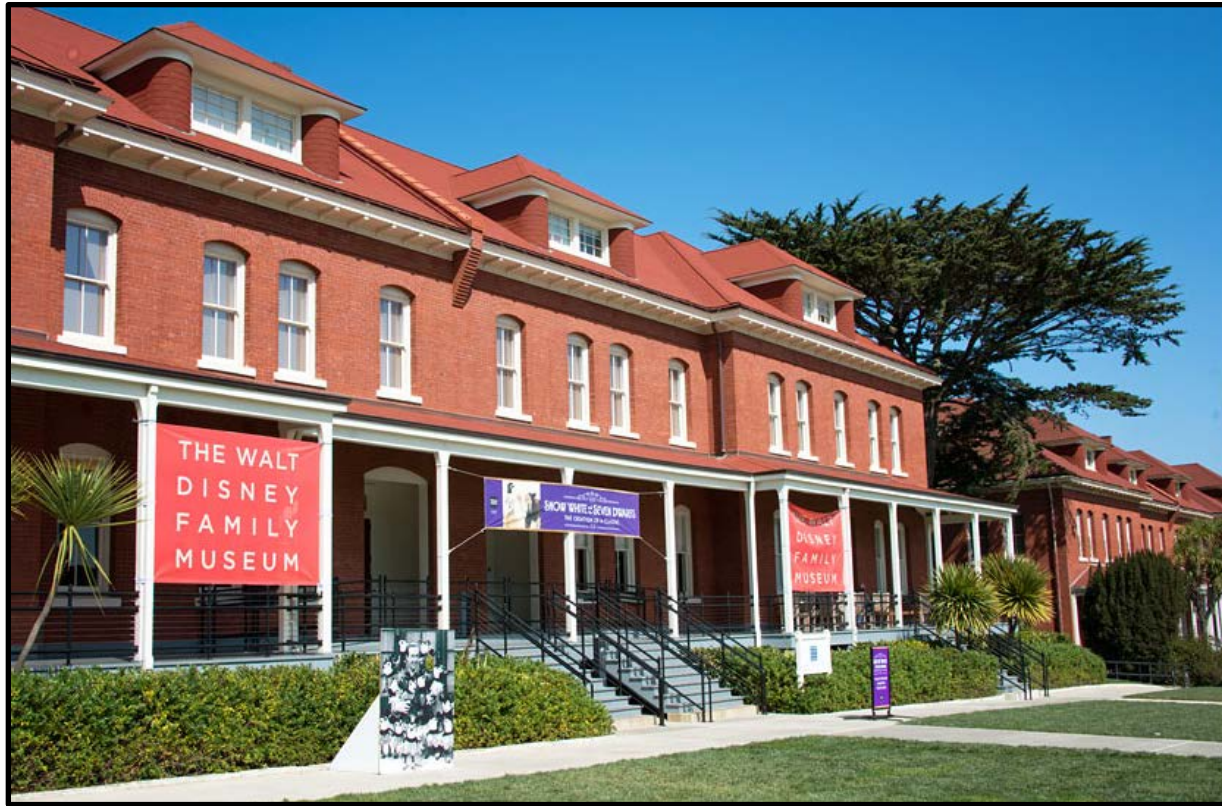
Presidio of San Francisco, San Francisco, California