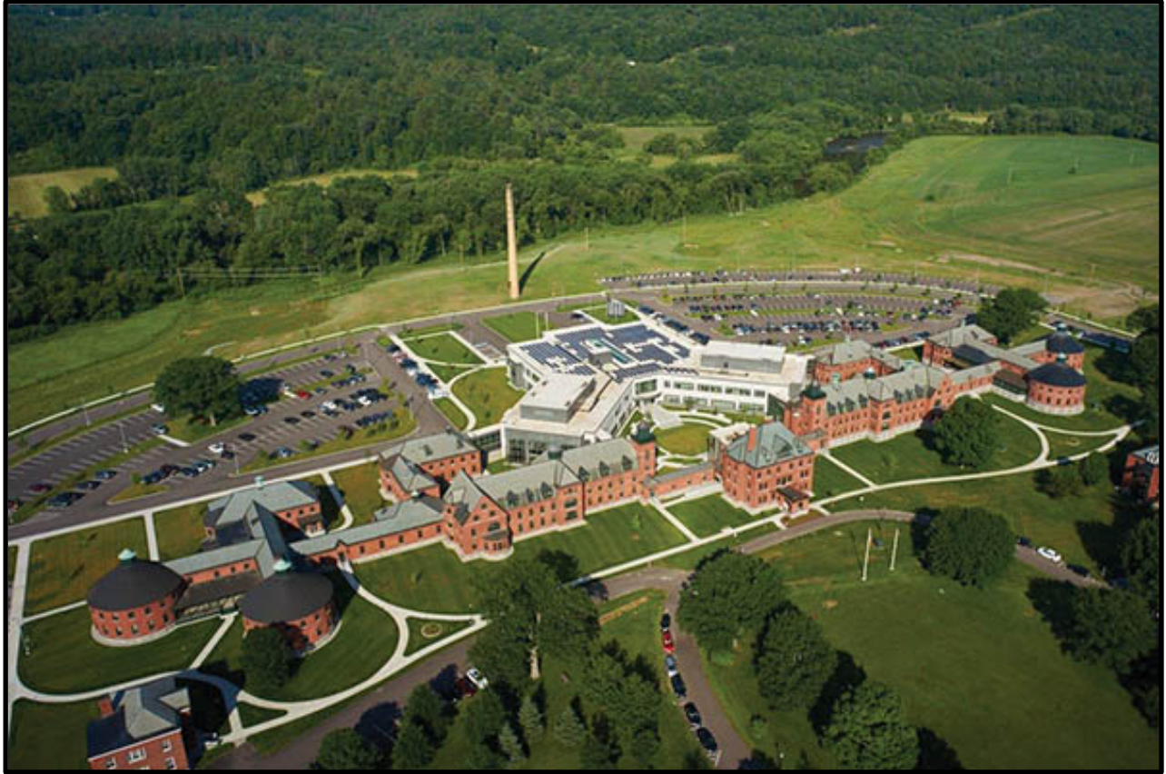
Waterbury State Office Complex, Waterbury, Vermont