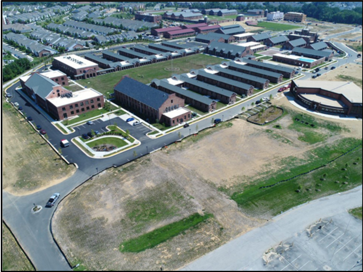
Liberty at Laurel Hill, Lorton, Virginia