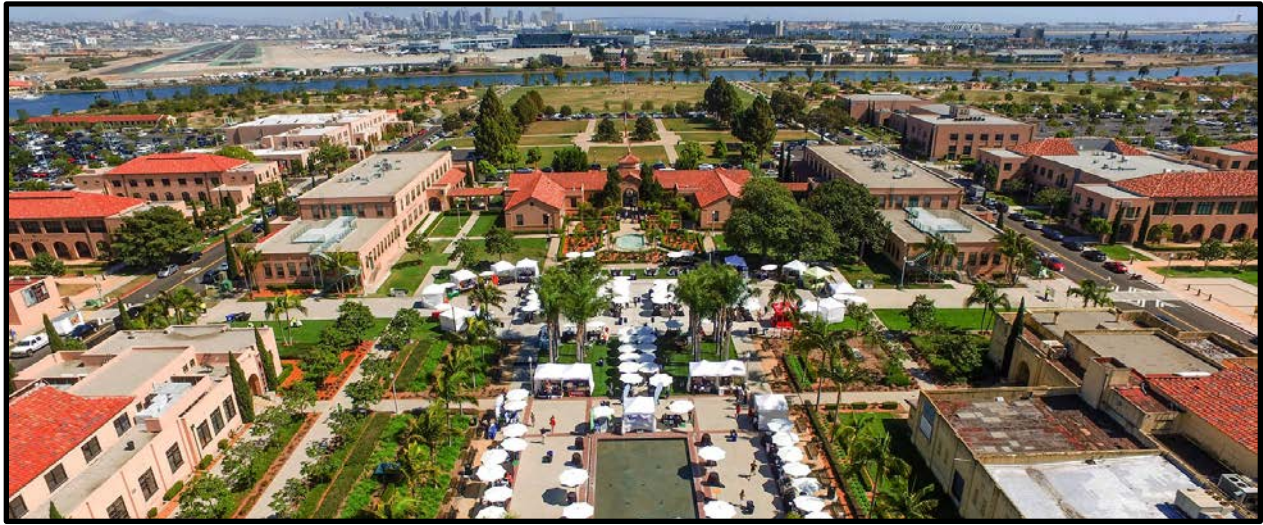
Liberty Station, San Diego, CA