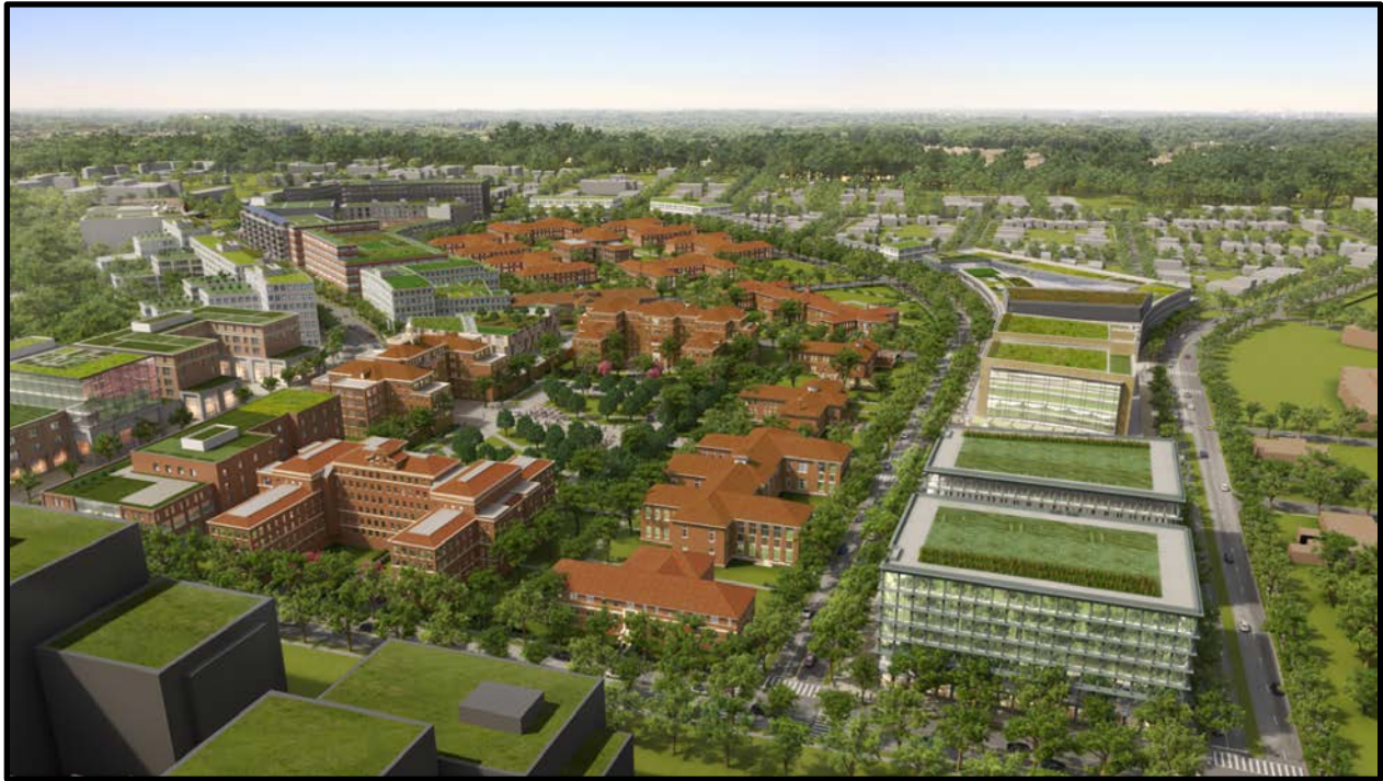
St. Elizabeths Campus, Washington, D.C.