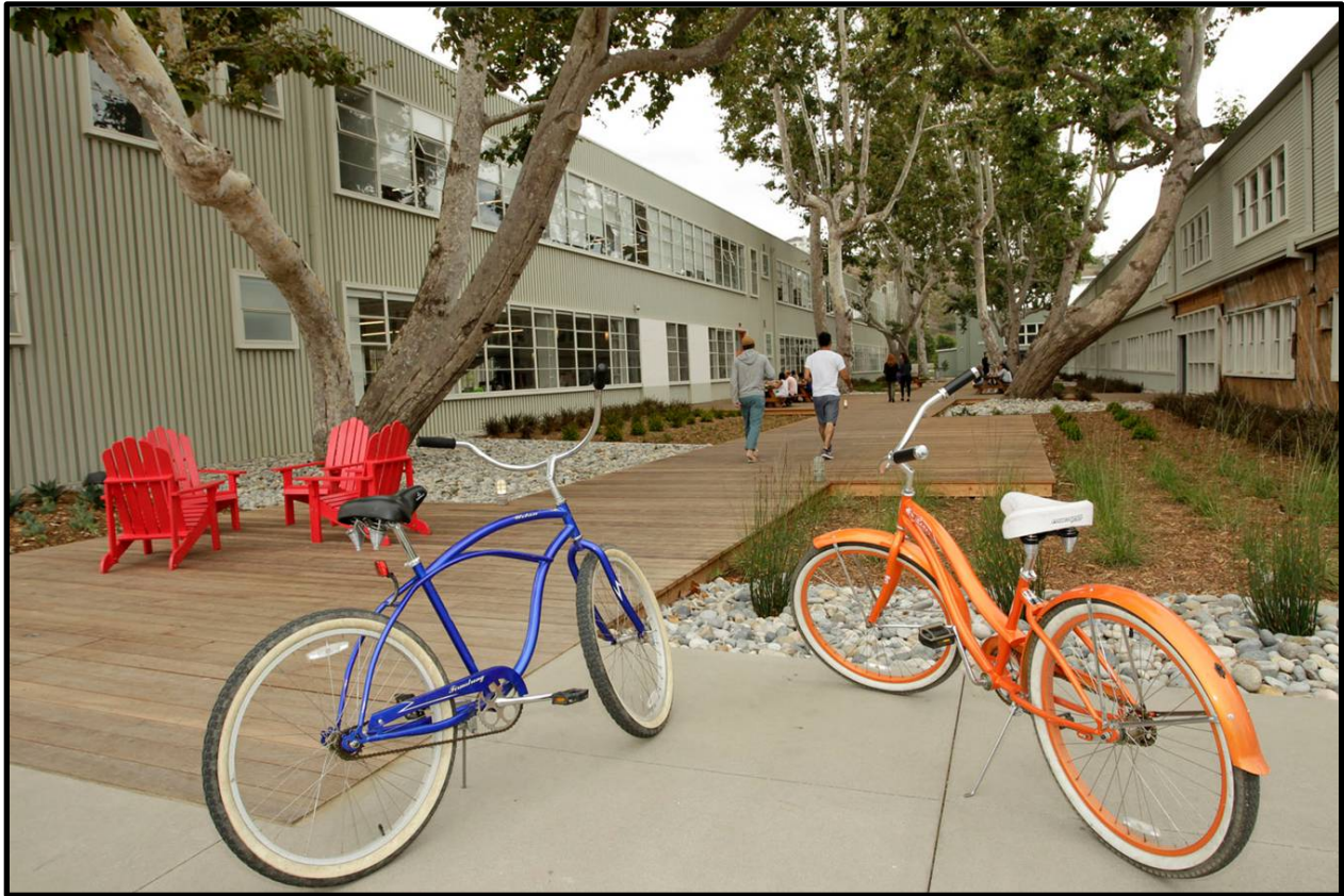
The Hercules Campus, Playa del Rey, Los Angeles, California