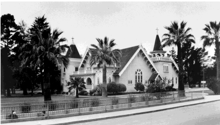
Wadsworth Chapel

This is the oldest building on Wilshire. It's a chapel – a place for people to pray and worship. When it was built in 1900, the architects designed it to have two chapels inside. One side is a Catholic chapel, and the other side is Protestant. If you look closely, you can see two kinds of windows on the chapel. Some are Romanesque, with rounded arches. Others are Gothic, with more pointed arches.