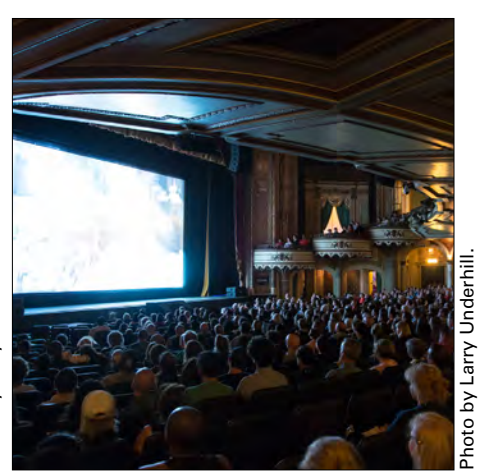
LAST REMAINING SEATS Wednesdays & Saturdays June 3–24

Help us honor the best in preservation at our annual Preservation Awards Luncheon! Learn more about the 2017 award recipients on pages 4-5.