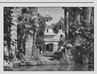
© J. Paul Getty Trust. Getty Research Institute, Los Angeles (2004.R.10).

The recipient of the Royce Neuschatz Award for Historic Landscapes, this document provides a vital guide for caring for the Arboretum's wide range of resources. The 127-acre property in Arcadia houses public gardens and several historic structures, including a Victorian cottage constructed in 1885 and an adobe dating from the 1840s. The cultural landscape report summarizes the history of the site, allowing for greater understanding of how to identify and protect the site's historic resources. The treatment plan will guide stewardship of the botanic gardens as well as significant buildings, allowing the public to continue to enjoy the history of this unique site.