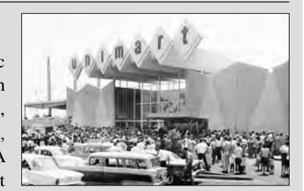
Shopping center complex opens in Burbank (1962).

The Valley Times was a daily newspaper published from 1946 to 1970. The Los Angeles Public Library received the newspaper's entire photo collection, which depicts an important time of growth and change in the San Fernando Valley. Photos include groundbreakings for construction projects, brand-new Mid-Century Modern buildings, aerial photos showing changes to the overall landscape, and more. Yet the photos had been stored improperly for decades and suffered from degradation. A project to process, organize, and digitize the Valley Times photo collection saved these important historic records. Now, this invaluable resource for researchers and preservationists can help tell the stories of significant events, people, and places in the Valley.