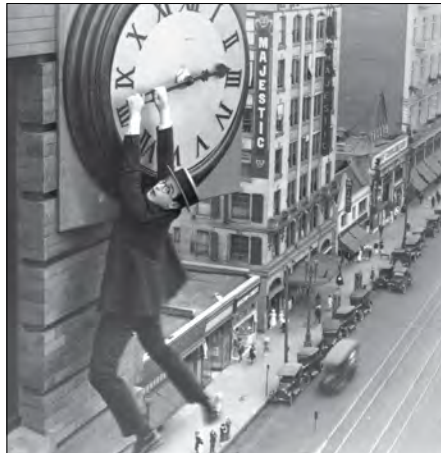
Safety Last! still

Join us as we celebrate the best in preservation! Individual ticket and table reservations available at laconservancy.org/awards . Learn more about this year's winning projects on pages 4-5.