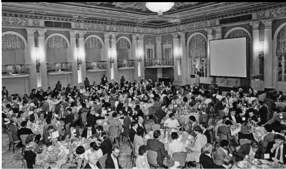
The Conservancy has presented Preservation Awards since 1982, and in the past thirty-five years we have recognized individuals, organizations, and projects representing a broad spectrum of preservation work. We began holding a Preservation Awards Luncheon to honor award recipients in 1987. Pictured: over 300 people attended the first Preservation Awards Luncheon in the Millennium Biltmore Hotel's Crystal Room.