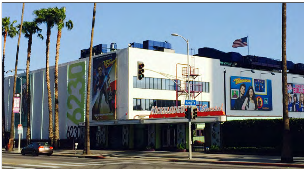
Developer Essex Portfolio has proposed a new mixed-use development next to the 1938 Earl Carroll Theatre building on Sunset Boulevard in Hollywood.

Along with Hollywood Heritage, we are now pressing for a clear preservation plan to guide a sensitive rehabilitation of the Earl Carroll Theatre, as well as a more meaningful exploration of reuse options. We also strongly recommend that the applicant nominate the building for listing as a Historic-Cultural Monument. The project will next go before the City Planning Commission.