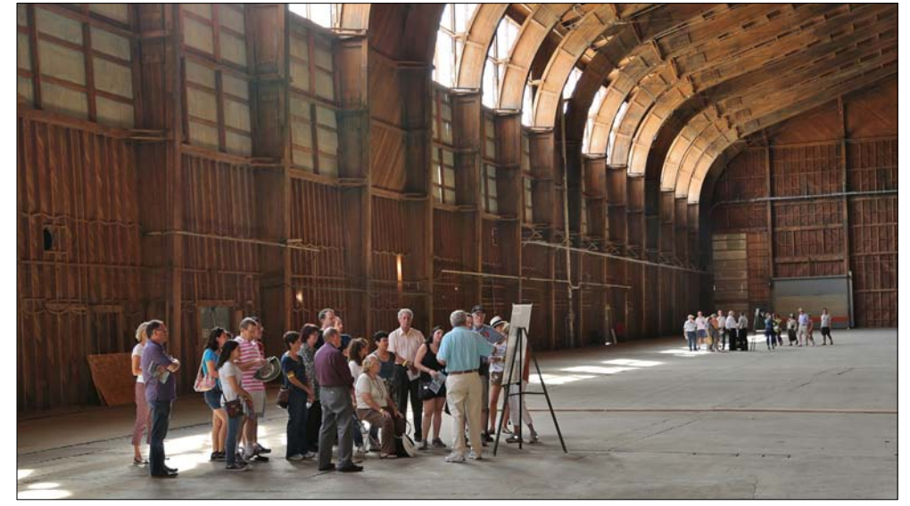
Tour attendees were impressed by the enormous Cargo Building, one of the largest wooden buildings ever built. It was designed to house the construction of the H-4 Hercules plane, also known as the Spruce Goose.

Saturday, October 24: The day dawned bright and beautiful over the former Hughes Aircraft Company campus, a welcome change from the torrential rain and winds that greeted staff and guests the first time the Conservancy toured this historic site in 2011.