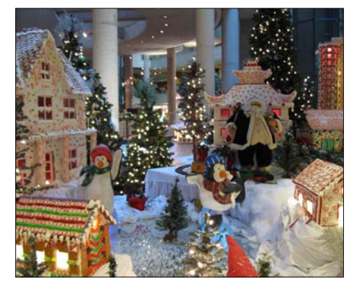
Gingerbread houses displayed at the Late Modern Westin Bonaventure Hotel in downtown L.A.

All tours are $5 for Los Angeles Conservancy members and youth 17 and under; $10 for the general public; reservations are required. Space is limited, so reserve now! Visit laconservancy.org/tours or call (213) 623-2489.