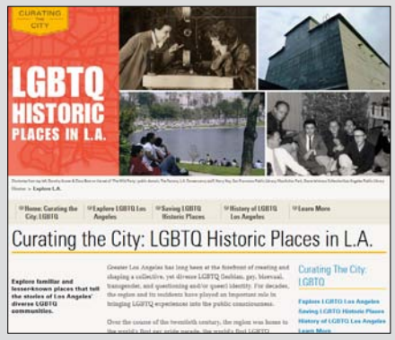
Visit our new microsite at laconservancy.org/lgbtq to discover L.A.'s rich LGBTQ history.

Learn more about our efforts to preserve historic LGBTQ sites in our cover story, and explore our new microsite at laconservancy.org/lgbtq . While you're there, please share any stories you have to help make the microsite an even richer resource. Thank you!