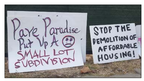
Local residents have mobilized to save a 1923 bungalow court at 750-756 \frac{1}{2} North Edinburgh Avenue.

The Meyer Courtyard Apartments and the Edinburgh Bungalow Court exemplify the growing threat to historic multi-family residences in Los Angeles—and the resulting loss of community character. This and other types of development pressure further underscore the need for neighborhood conservation tools used in other cities, such as conservation districts.