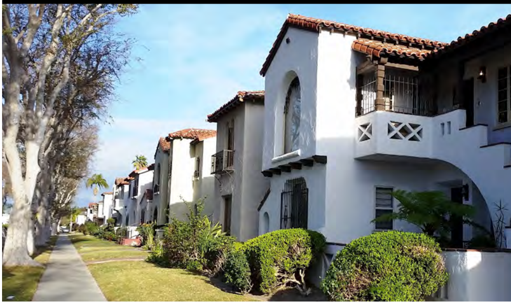
In June of this year, the City of Los Angeles adopted a new West Adams-Baldwin Hills-Leimert Park Community Plan. The plan identifies the historic Leimert Park neighborhood as an area warranting preservation and neighborhood conservation strategies.