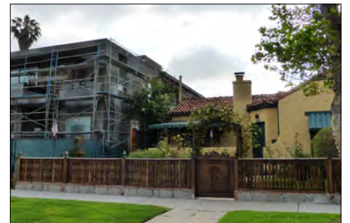
An example of out-of-scale construction in Carthage Square.

The Conservancy helps preserve the fabric of our neighborhoods by working with residents, community groups, and government officials to influence a range of new poli-