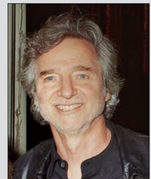
Curtis Hanson at Last Remaining Seats in 2007.

Hanson grew up in the San Fernando Valley and was dedicated to preserving Los Angeles' historic places. He served on the Conservancy's Advisory Council for many years, and he hosted screenings at our Last Remaining Seats film series in 2002, 2003, and 2007. We miss him and will always appreciate his support.