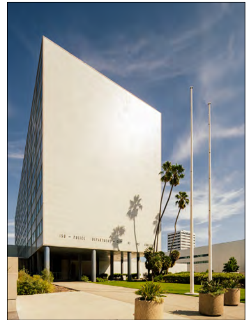
The threat to Parker Center heated up again in August after the City's Municipal Facilities Committee voted in support of a proposal to demolish the former LAPD headquarters.

Following the procedural error with last year's Historic-Cultural Monument nomination, the Cultural Heritage Commission (CHC) agreed to delay further nomination efforts for Parker Center to allow time for the Bureau of Engineering to develop Alternative B4 (as directed by Councilmember Huizar). Members of the Commission and the Conservancy are deeply disappointed in the Bureau of Engineering for not collaborating