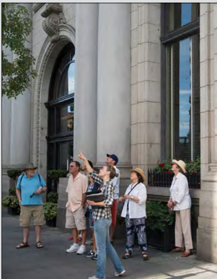
Walking tours fill up quickly during the holiday season — be sure to make your reservations early!

Tours cost $10 for Conservancy members and youth 17 or younger; $15 for the general public. You may purchase up to four tickets per tour at the discounted member rate.