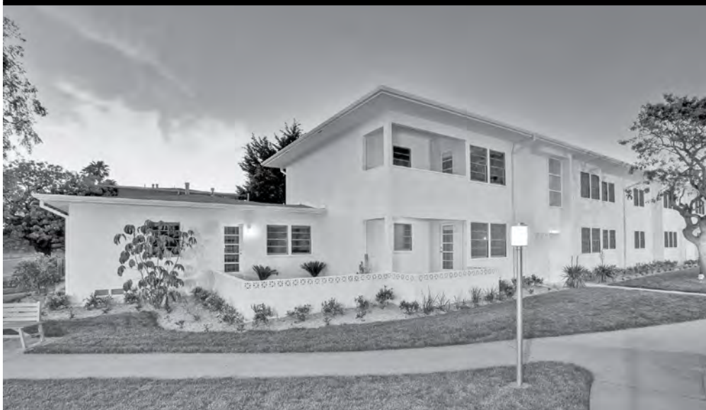
Lincoln Place is one of three "villages in the city" we will visit on our one-day tour.