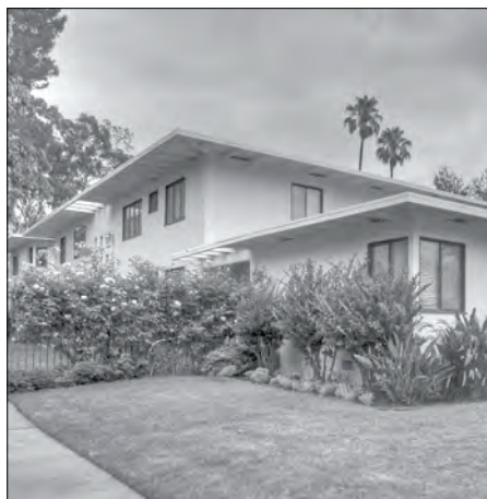
Chase Knolls.