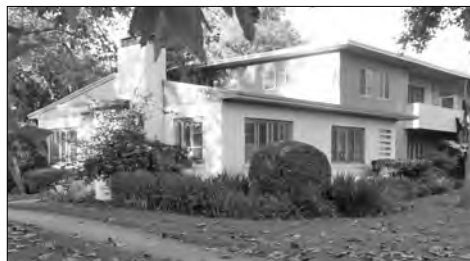
1941 Village Green in Baldwin Hills.

It has been lovingly preserved and cared for by generations of residents. It is the only garden apartment community in California designated as a National Historic Landmark, the highest level of recognition bestowed by the National Park Service.