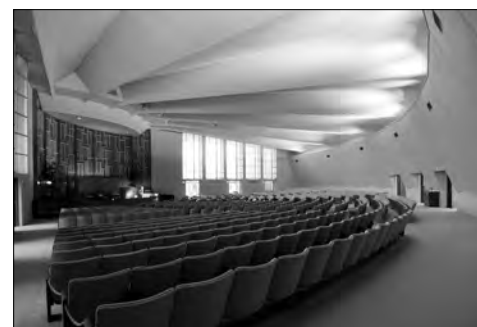
Fan-shaped accordion ceiling of the former Fifth Church of Christ, Scientist's auditorium.

As proposed, the project would have 140 apartments in three buildings of six, eight and twenty-four stories. The Conservancy is pressing for the consideration of preservation alternatives that would retain and incorporate the building as part of the proposed project.