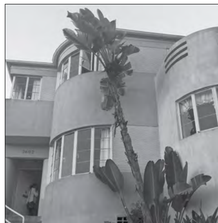
View Park residence.

Celebrate the holiday season at our annual holiday matinee. Join us at the historic Orpheum Theatre for a screening of this holiday favorite. See page 5 for details.