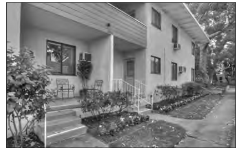
1948 Chase Knolls in Sherman Oaks.

In 2000, the then-owners planned to demolish the 260-unit development and replace it with a project that would double the density on the site. Following strong opposition from long-time tenants, elected officials, and the Conservancy, the owners ultimately decided to preserve Chase Knolls. The buildings have since been rehabbed with new roofs, period-appropriate paint colors, and the restoration of key features.