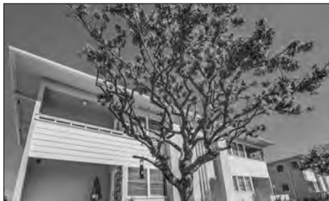
1951 Lincoln Place in Venice.

Learn much more about the history and preservation of these communities at the "We Heart Garden Apartments!" tour on Saturday, November 1. We hope to see you there!