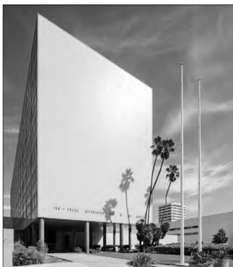
The Welton Becket & Associates-designed Parker Center reflects important, complex aspects of Los Angeles history.

The building was first threatened with demolition for a new police facilities building in the early 2000s. The City considers the now-vacant Parker Center's central location prime for housing city staff and addressing the need for approximately 1.1 million square feet of office space. At an estimated cost of