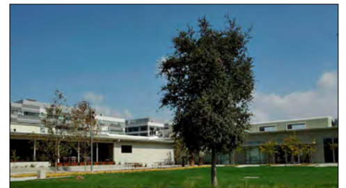
The Conservancy will tour the recently restored former Hughes Aircraft Company, now the Hercules Campus.

Renamed the Hercules Campus, the site's transformed historic buildings are now thriving and in use by technology and creative firms such as YouTube.