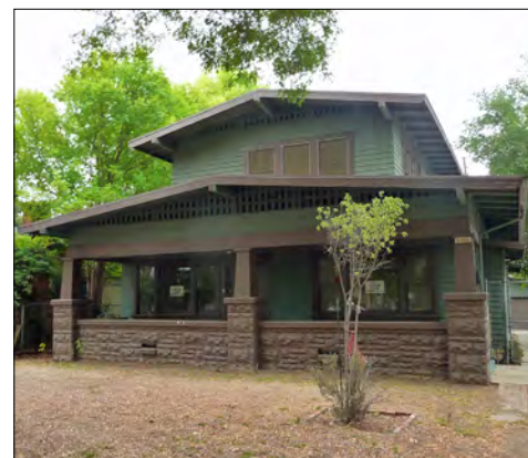
This Craftsman bungalow in El Sereno is one of approximately 450 properties Caltrans owns for the 710 Freeway Extension project. This house is set to be sold by Caltrans in the near future.

In March 2015, Caltrans released the Draft Environmental Impact Report/Environmental Impact Statement (EIR/EIS) for the SR 710 North Study. The Draft EIR/EIS studies the potential impacts of four "build" alternatives, including the Freeway Tunnel