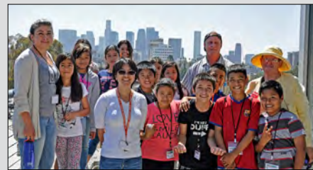
The 2015 Adventures in Architecture group at the American Cement Building Lofts.