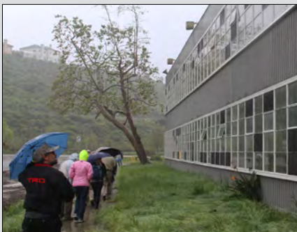
Our 2011 tour explored the former Hughes Aircraft Company campus before restoration began. See the recently preserved and adaptively reused buildings on our October 24 tour.

Tickets are $25 for Conservancy members, $35 for the general public, $15 for students, and $10 for children twelve and under. Visit laconservancy.org/hercules to reserve your space for this very special event.