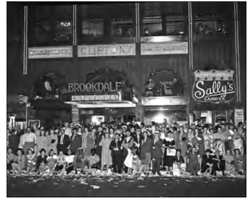
A crowd stands in front of Clifton’s Brookdale Cafeteria during a V-J Day celebration on August 14, 1945.

That setting remains today—cleaned, restored to its 1930s aesthetic, and re-envisioned for new generations. Meieran and his team removed later additions, such as the 1960s entrance and the large aluminum grille covering the exterior. They uncovered original features that were hidden for decades, including murals and a tiny grotto near the front entrance. Meieran even discovered an original—and still glowing—piece of neon in the basement. (It’s still glowing, just moved to a new location so everyone can see it.)