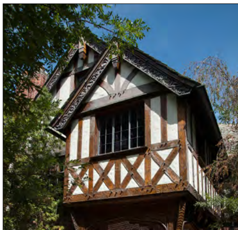
The Conservancy is thrilled to hold our 2015 benefit at the 1926 Tudor Revival Waverly Mansion on Saturday, October 17.

The estate has been lovingly rehabilitated and reimagined by its current owner. Nearly four acres of rolling landscaped grounds incorporate mature trees that predate the home, as well as beautifully manicured lawns, fountains, and a bridge-covered natural stream. The property features a Tudor-style garage, former servants’ quarters, and a large pool. The grandeur of the space, both inside and out, can be fully appreciated only in person.