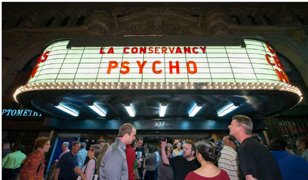
Fans filled the historic Million Dollar Theatre (1918) for our opening-night screening of Psycho (1960).