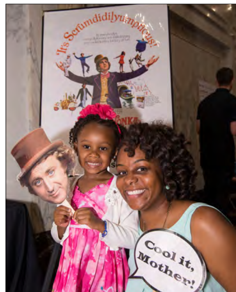
Movie fans at the always-popular Selfie Spot before Willy Wonka & the Chocolate Factory at the Orpheum Theatre.