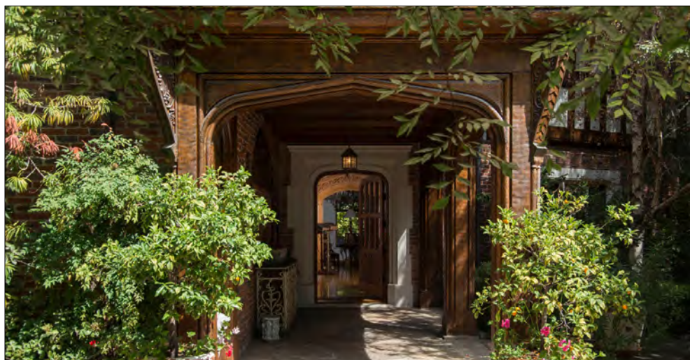
Waverly Mansion in Beverly Hills.

For details and tickets or sponsorships for this extraordinary event, visit laconservancy.org/benefit .