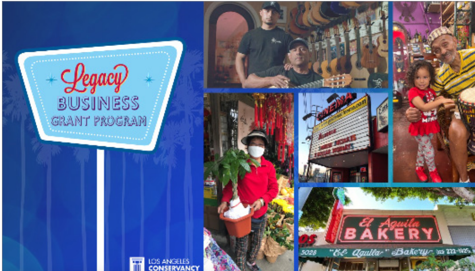
L-R: Legacy Businesses Grant Program;,.