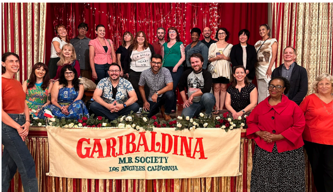
Community Leadership Boot Camp Reunion in 2023.