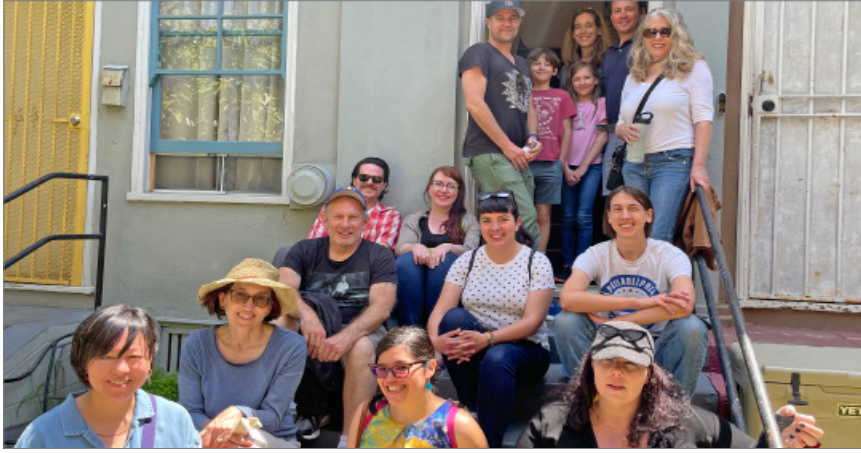
Community Leadership Boot Camp Participants in 2023.