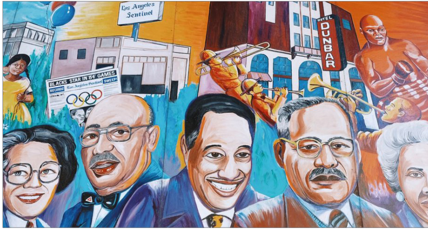
Mural opposite the historic Dunbar Hotel in the Central Avenue Corridor.