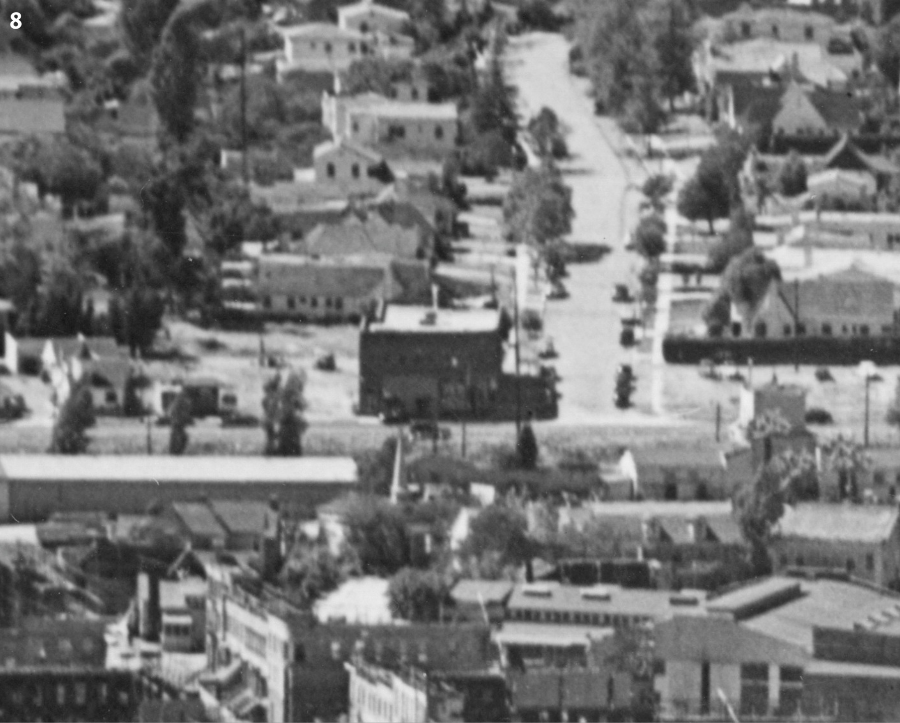
Fox Studios, aerial view northeast, 1948