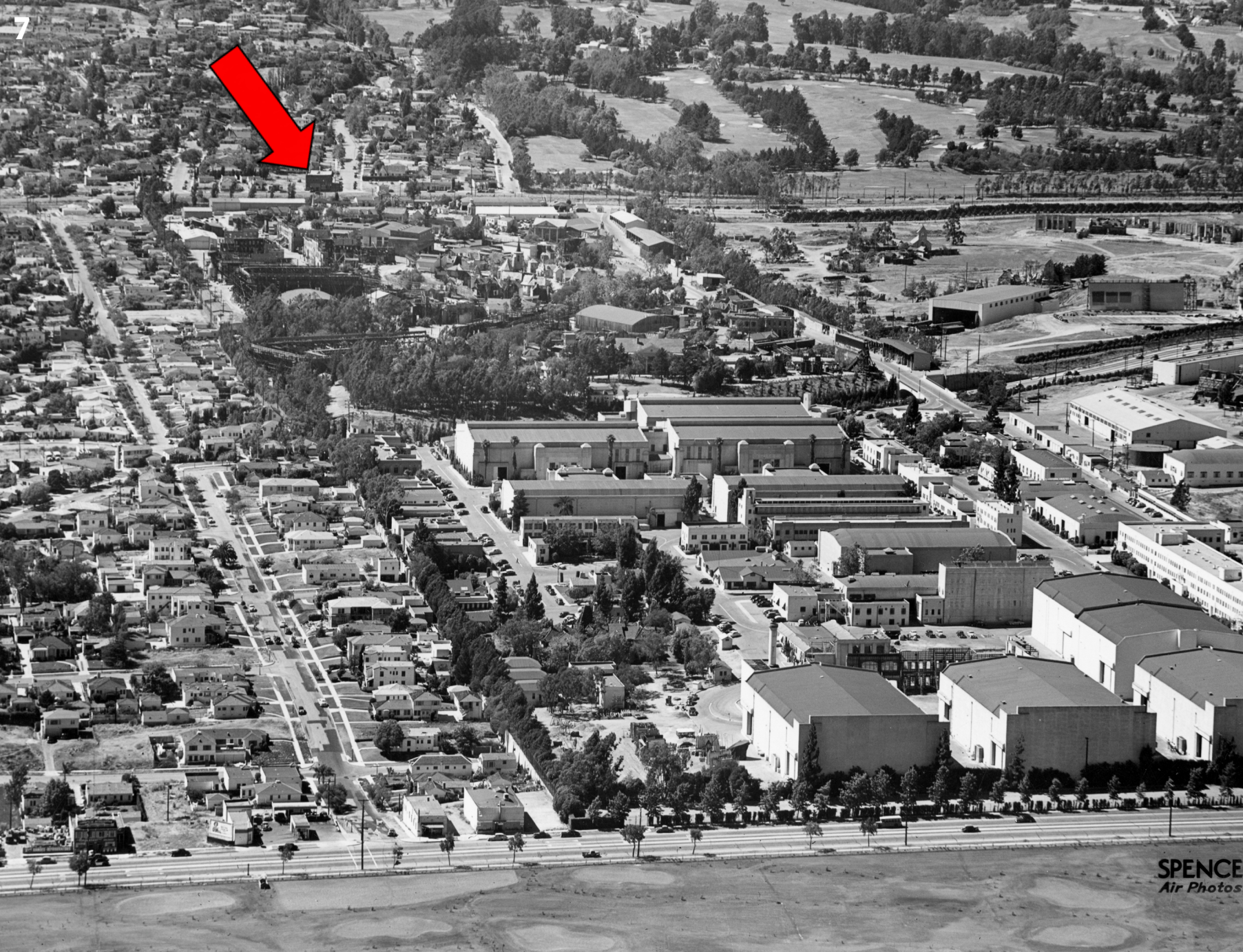
Fox Studios, aerial view northeast, 1948