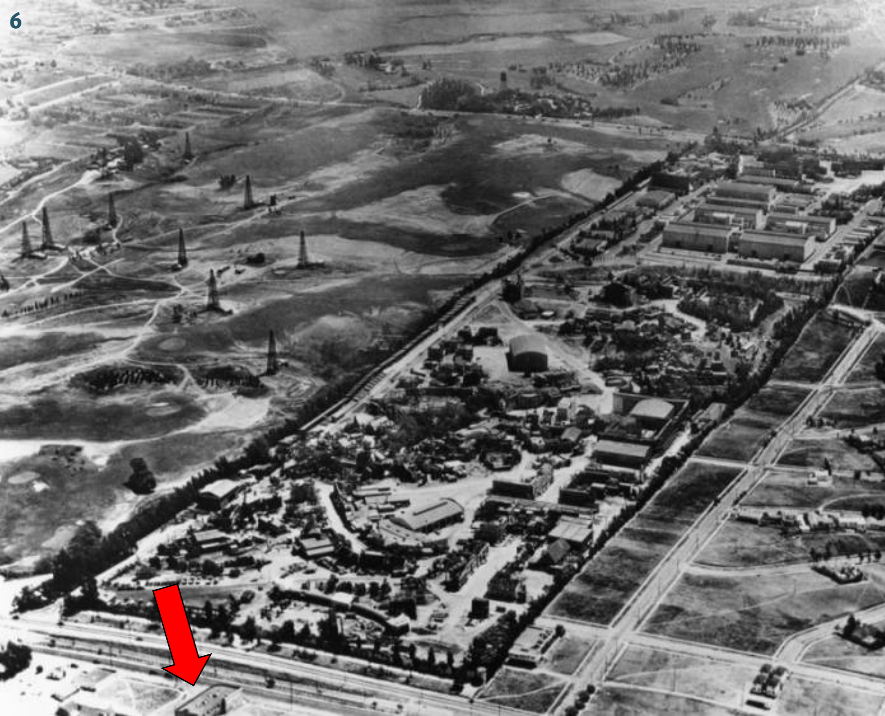
Fox Studios, aerial view southeast, c. 1930